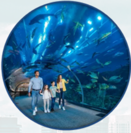
TUNNEL AQUARIUM DESIGN & INSTALL