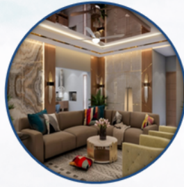
INTERIORS DESIGN & DECORATE