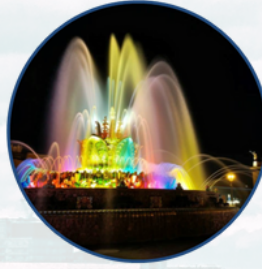
MUSICAL FOUNTAIN DESIGN & INSTALL