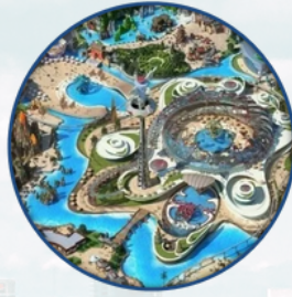
WATER PARK DESIGN & BUILD