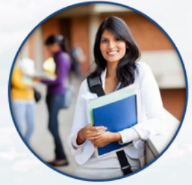
DESIGN & BUILD SKILL TRAINING