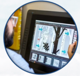
MEDIA GRAPHIC DESIGN & DELIVER