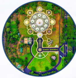
LANDSCAPE PLANNING & PLANTATION