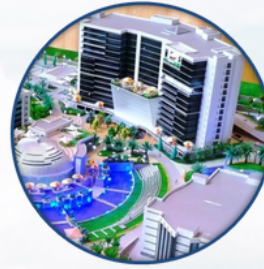
3D MINI MODEL DESIGN & DELIVER