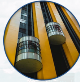
VERTICAL TRANSPORTATION CUSTOMIZE & INSTALL