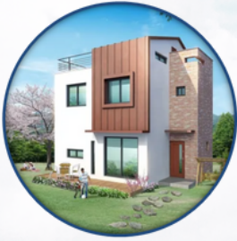
ARCHITECTURE DESIGN & BUILD