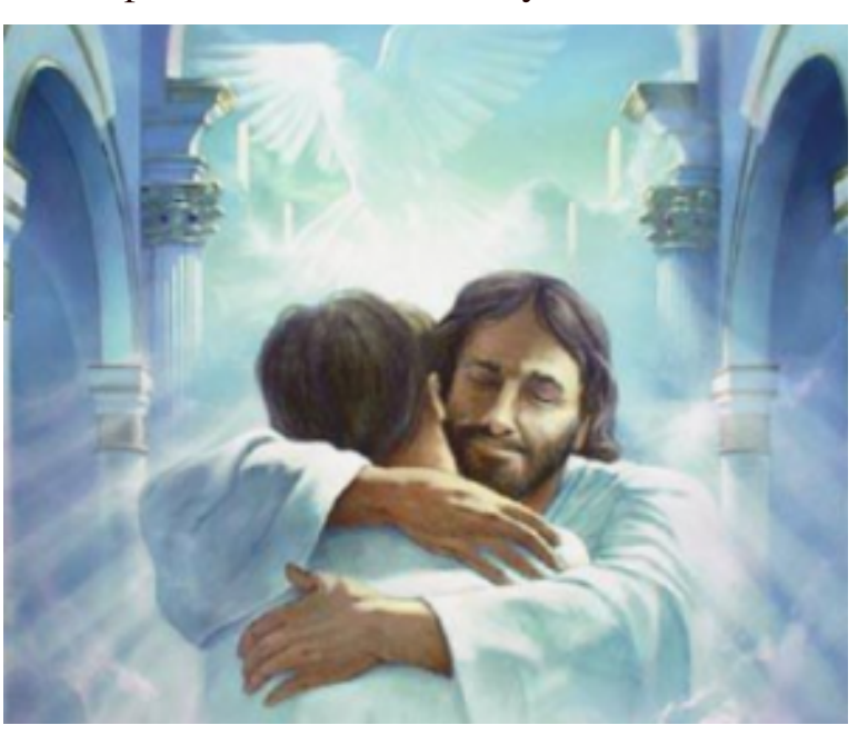
me, "Come to me; you are blessed. There's a place prepared for you in my Father's mansions."

That's when I will see His face with pleasure, and He will say to