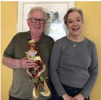
Venue 1 Winners