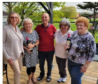
Venue 2 “Non-Winners”