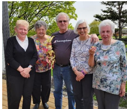
Venue 2 Winners