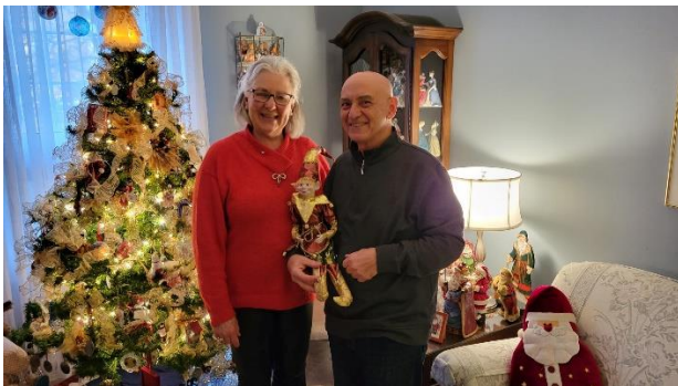
Round Robin Champions