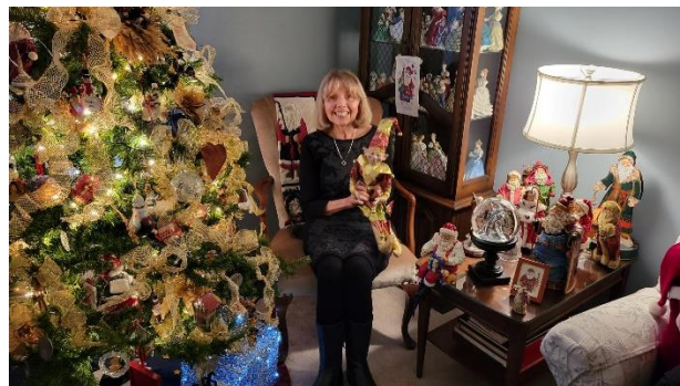
Jester of the Year