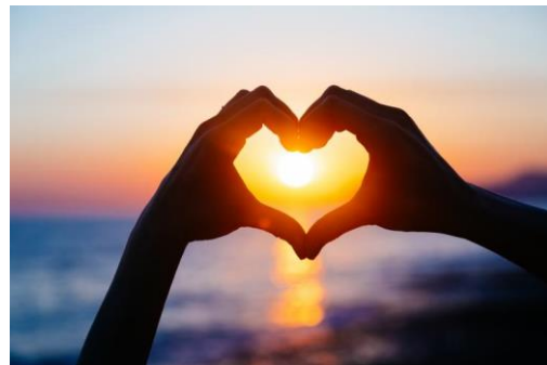
Feb. 14 Valentine's Day