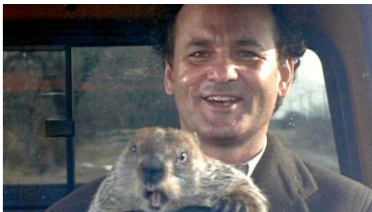
Feb 2 Groundhog Day