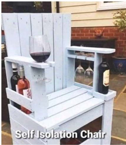
Self Isolation Chair