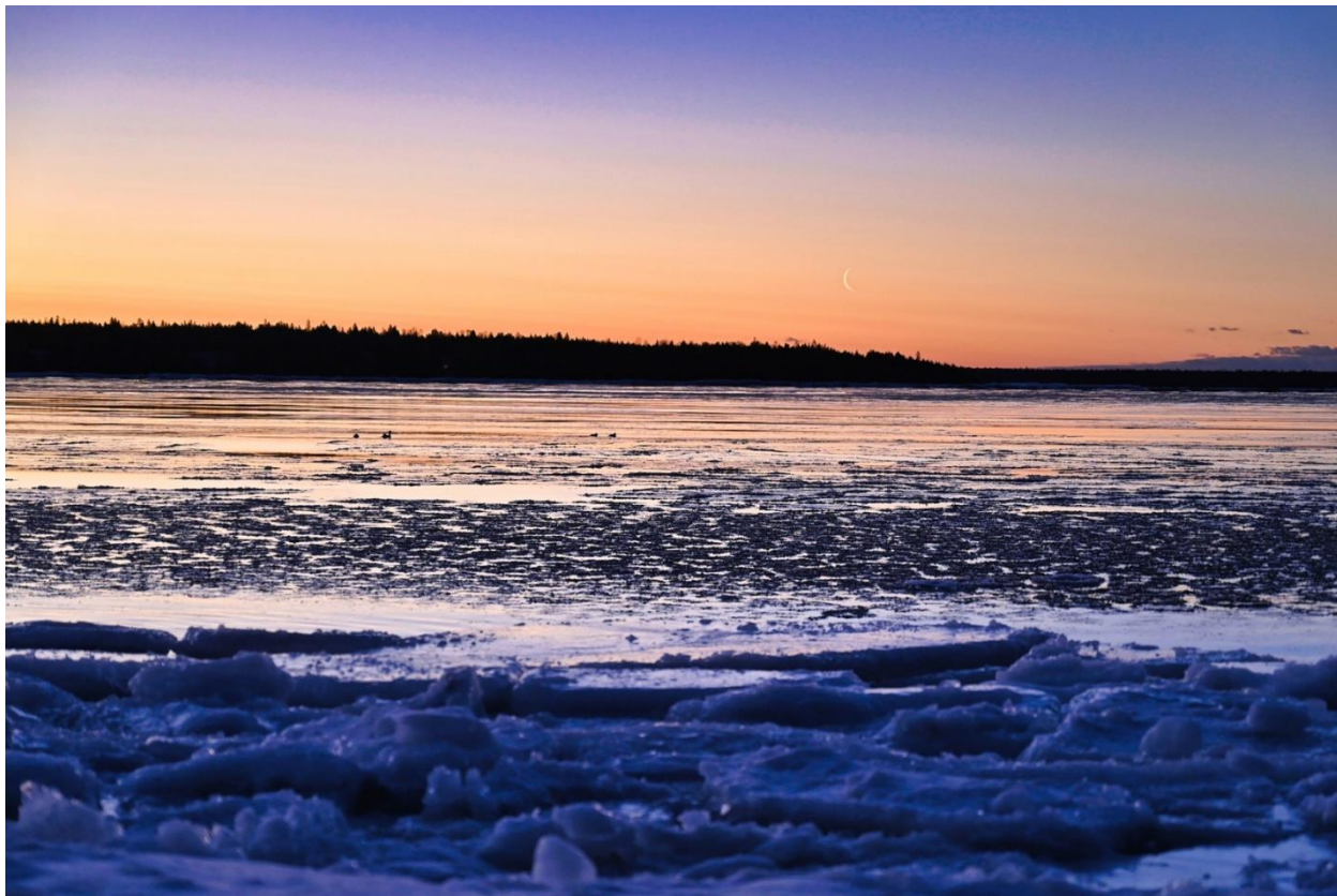
The Waning Crescent moon appears at Sunrise