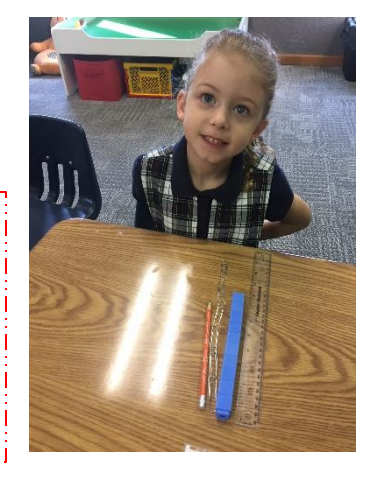
We are learning about measuring.