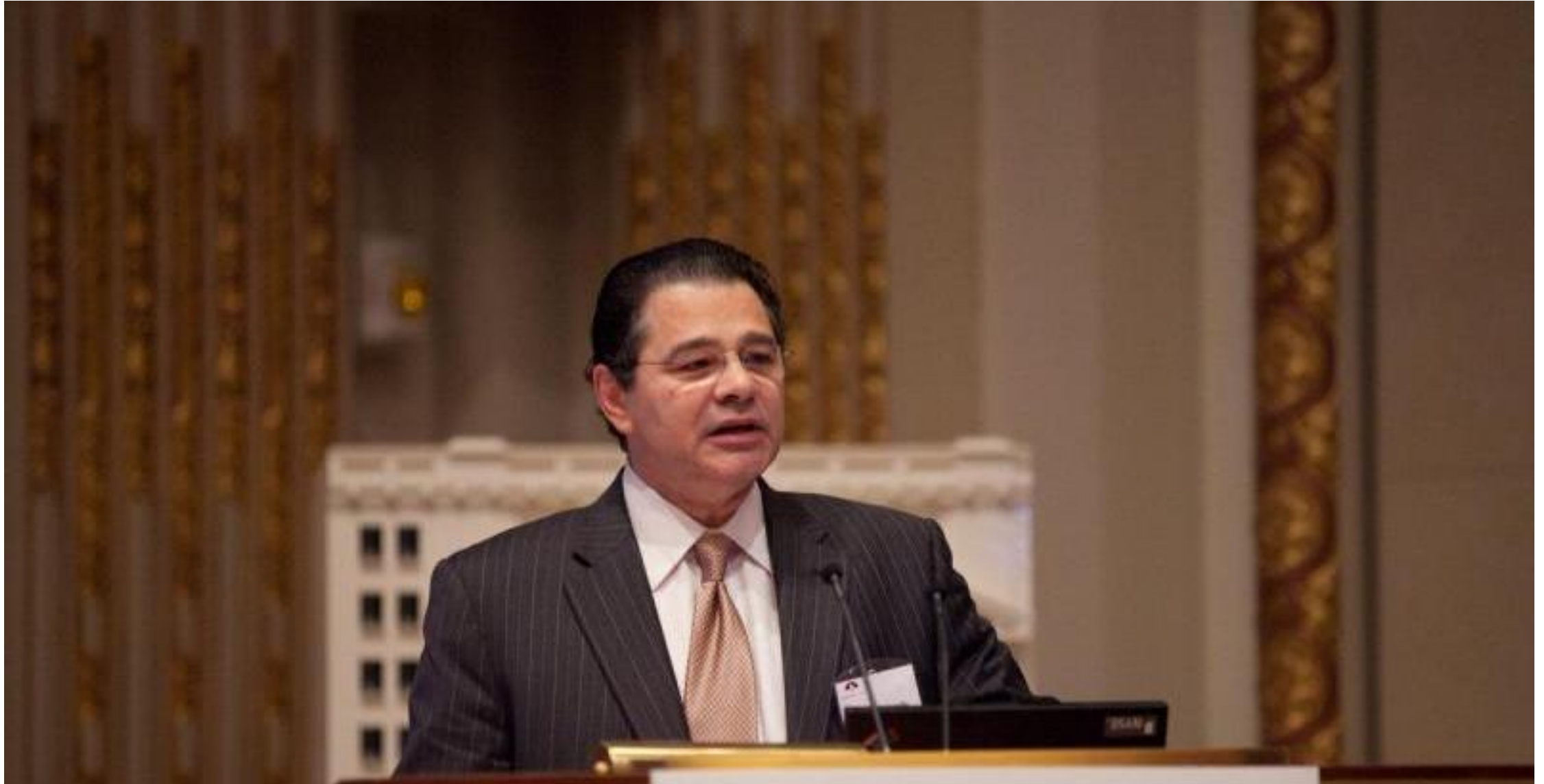
Global Leaders: Mr. Daniel D'Aniello, Co-Chair of Carlyle