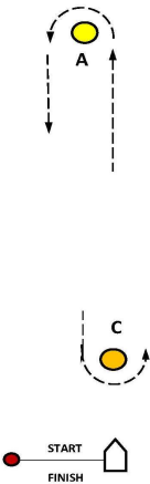
COURSE 5 and 6 DIAGRAM and ROUNDING ORDER (Not to Scale)

COURSE 2: START – A – C (or GATE) – A – C (or GATE) – A – FINISH