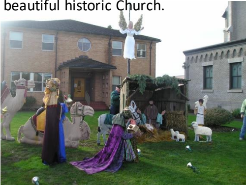
After travelling all through Advent, the Kings have finally found the Christ Child and can see him in the manger.

This is the third Advent Season that St. Mary Parish has had a life-size Nativity. This is no ordinary Nativity scene, as it travels through Mt. Angel until coming to its home on the lawn of St. Mary's, just in front of the Parish Office building. This year Mary, Joseph and their donkey began the trek at the base of Mt. Angel Abbey hill. The three kings and 2 large camels followed at a distance, throughout the four weeks leading up to Christmas. This colorful display is befitting the grandeur of St. Mary's beautiful historic Church.