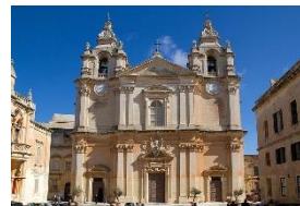
The Cathedral Church set within Mdina (The Silent City)

One of the most significant religious events in Malta is the shipwreck of St. Paul on the islands in 60 AD, which changed Malta's religious history forever. It is said that St. Paul performed several miracles, including the healing of the governor's father, Publius, who later became the first bishop of Malta. 1 This event marked the beginning of Christianity in Malta, and by the third century AD, almost all the inhabitants of Malta were Christians.