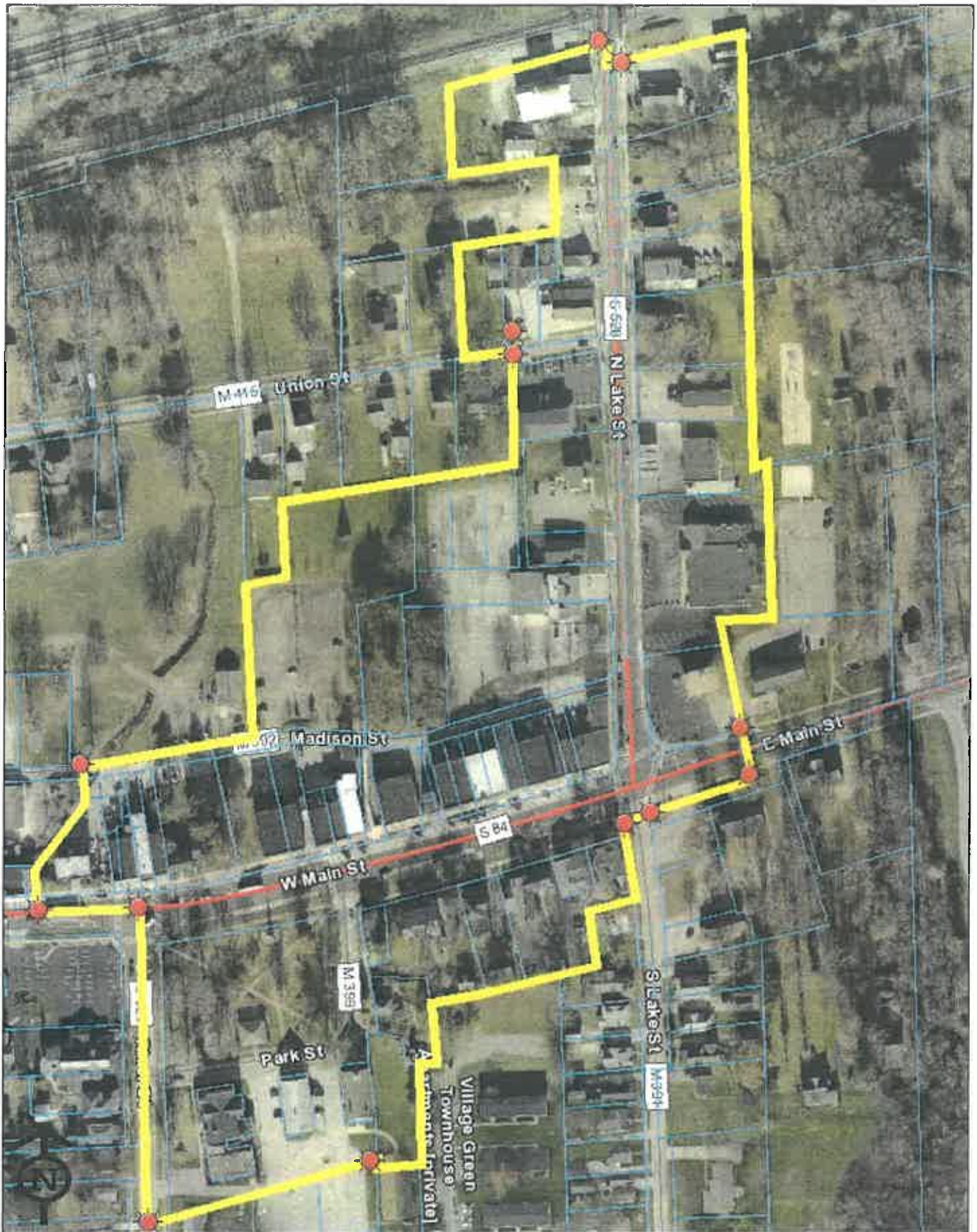
Exhibit "3" DORA signage locations

Property lines are graphic representations and are NOT survey accurate. Lake County GIS Dept. / Lake County Tax Map Dept., 105 Main Street, Painesville, OH