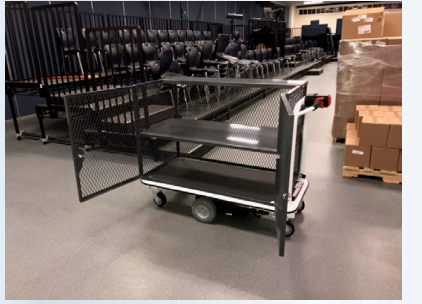
The MotoCart electric utility cart with custom cage and shelving