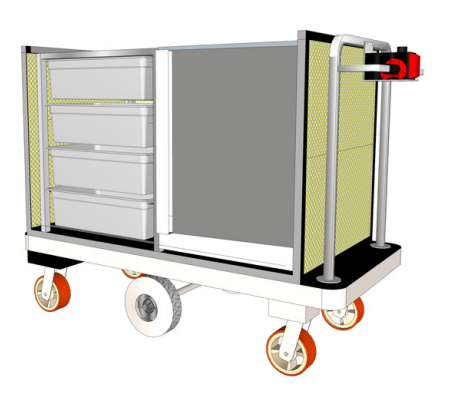
Gel refrigerant hotel pans and cold box with ice plates.