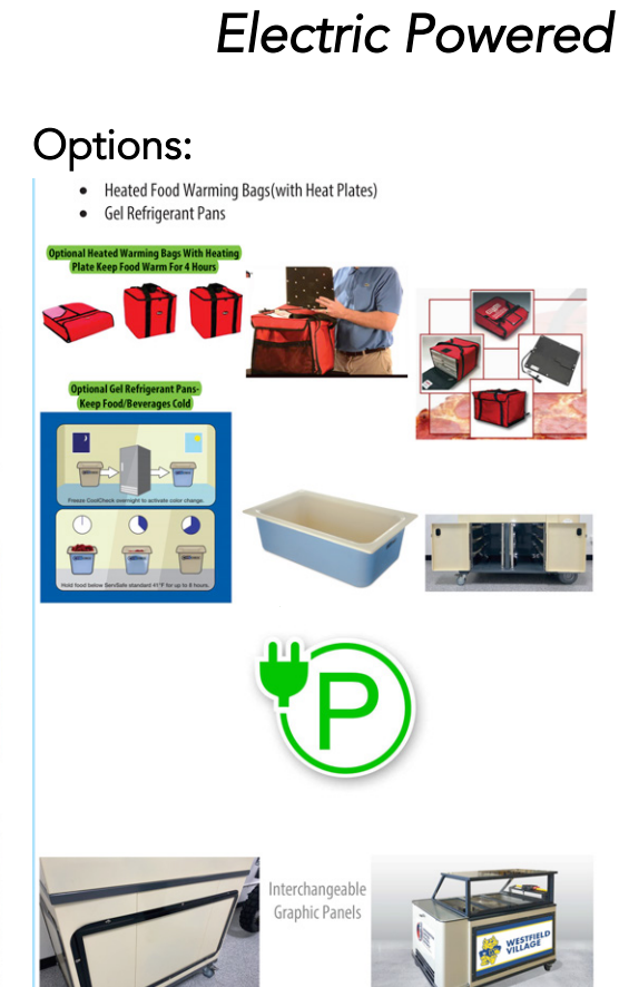
Select your choice of base model then contact us for the next steps to customize.