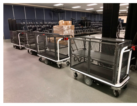
MotoCart with adjustable internal shelving for maximum capacity. Transport product safely.