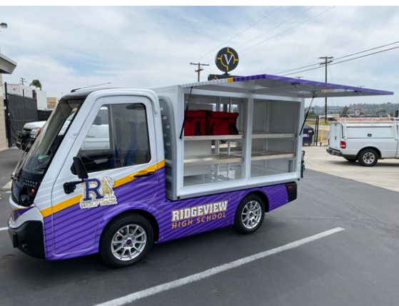
Rear 110v power port creates your POS station