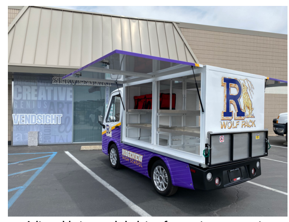
Adjustable internal shelving for maximum capacity