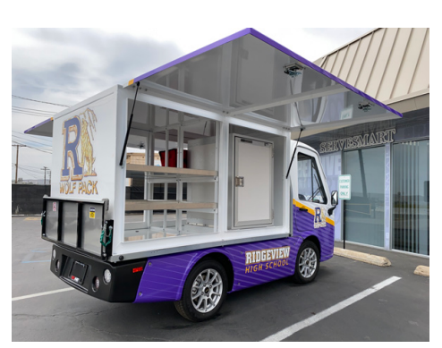
Internal 12v power ports and food warming bags with internal heating plates