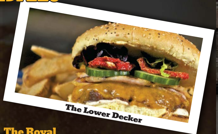
The Lower Decker

Housemade with our unique blend of herbs and spices, chickpeas, lentils, black beans and rolled oats. Topped with crumbled goat cheese, tomato, spring lettuce and tzatziki. Served with a side salad.