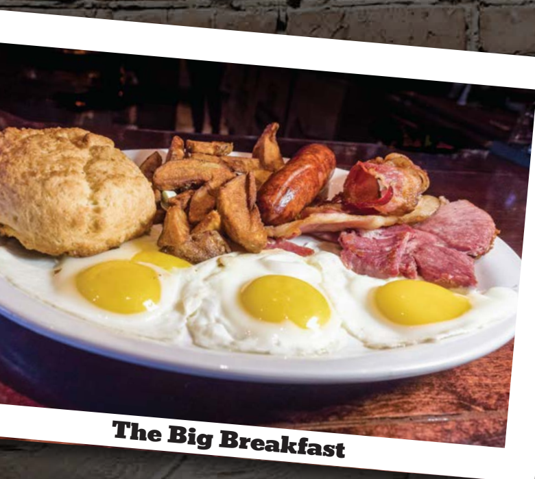
The Big Breakfast