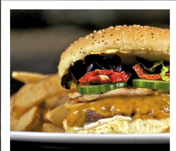
The Lower Decker

Swiss cheese, cheddar, jalapeño havarti, horseradish aioli, spring lettuce, tomato and house made pickles.