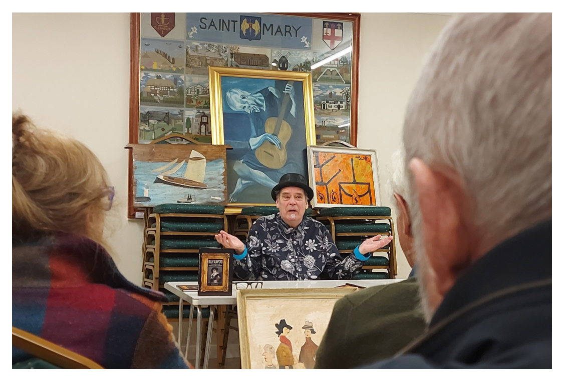
BILLY THE BRUSH