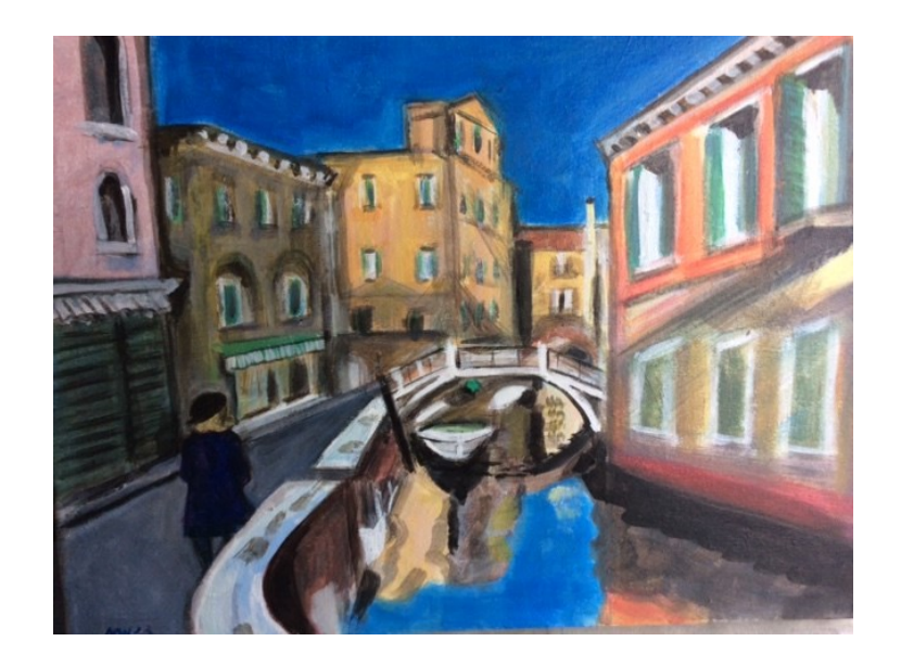
Acrylic on Canvas By Nicola Willoughby