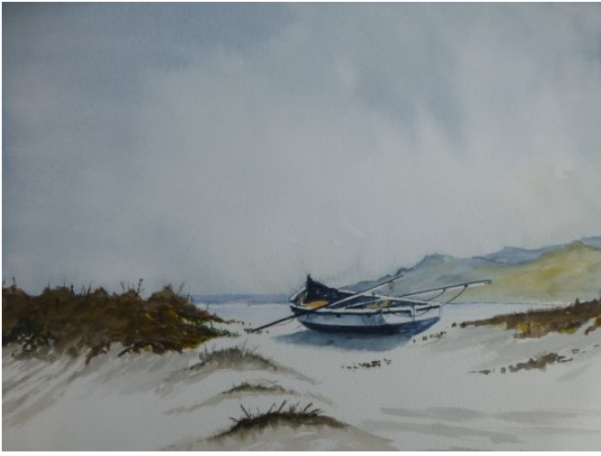
"Boat on the Dunes"

Painted from a picture I took in the Western Cape