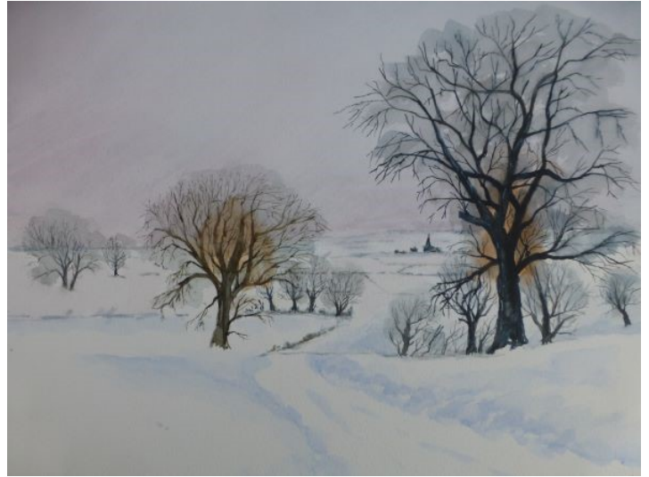
Left and Above