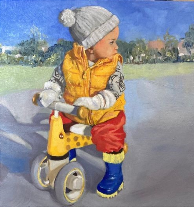
"My New Bike"