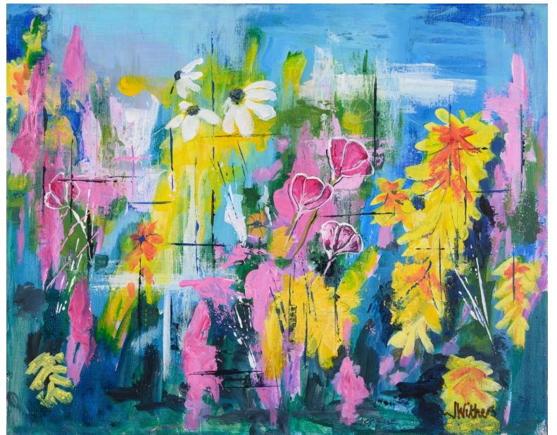
Left "Sculpture in the Garden, Borde Hill". Acrylic. 50 x 70cm " by Joy Withers