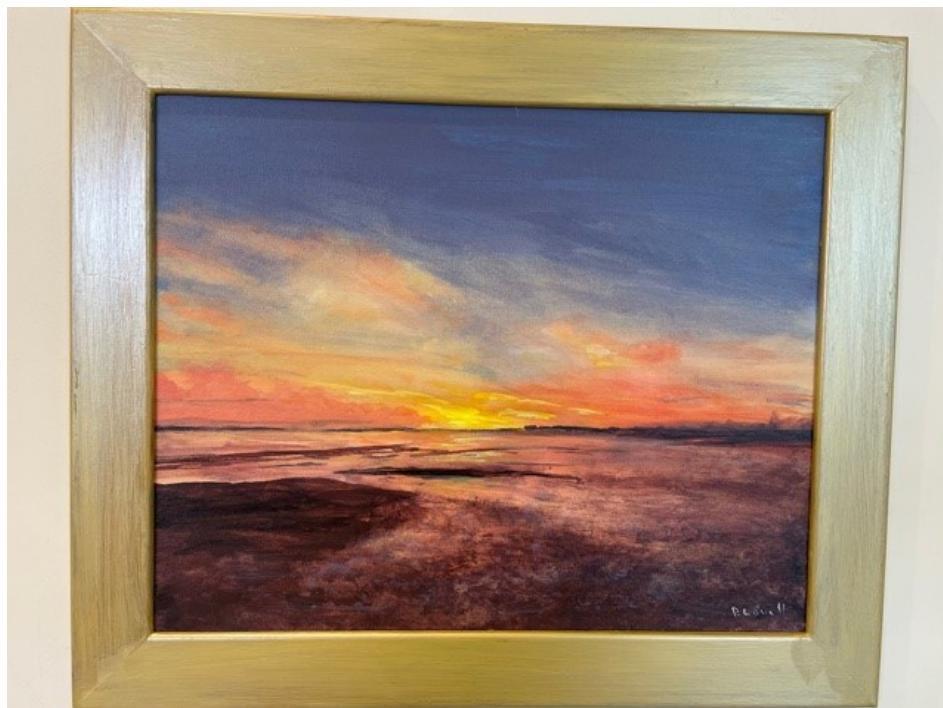
"Clymping Beach in Autumn Sunset"