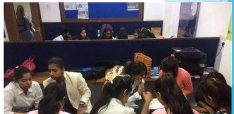
Presence More Than 16 States