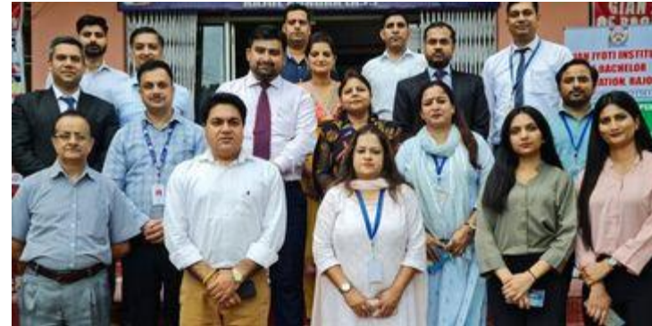
20+ Expert Counselors