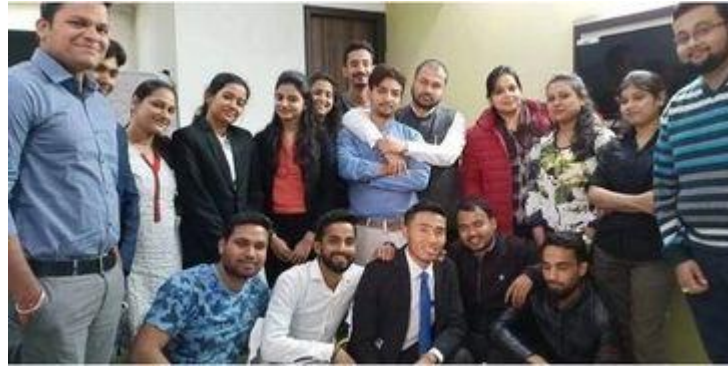
7500+ Internship with PPO