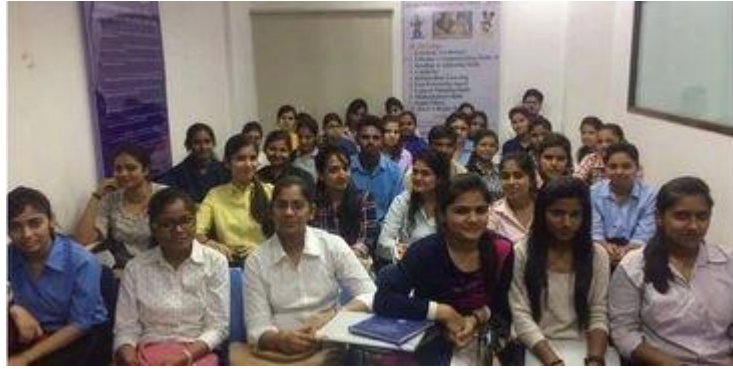
6000+ Training with Placement