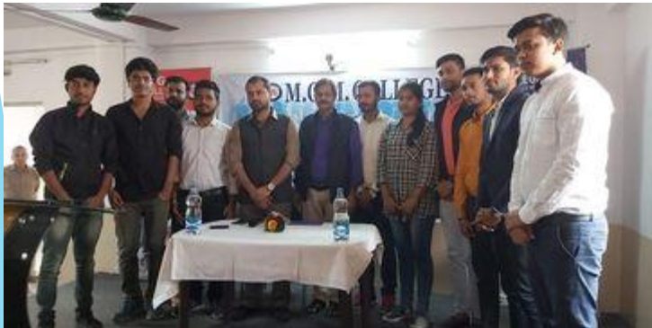
30+ Quality Mentors