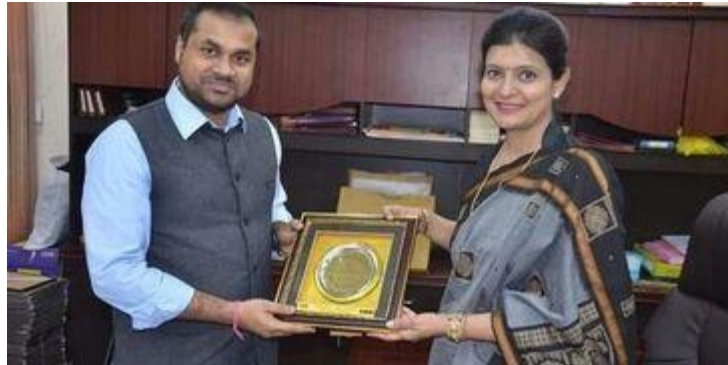
60+ College Association