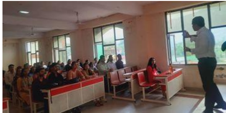
2 Lac+ Online Training Programs