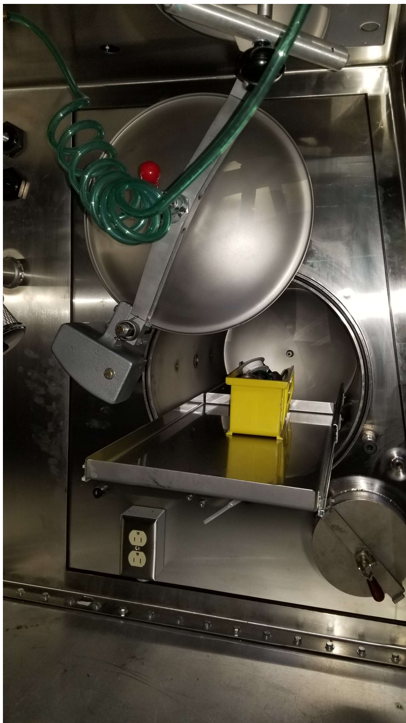
Internal view of large antechamber, internal evacuable gloveport cover is stored on ceiling