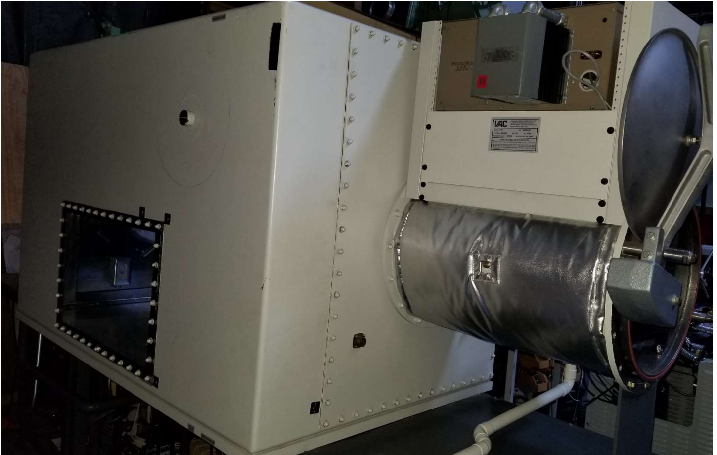
Rear view showing back window. Option of adding a gloveport and KF 40 feed thrus