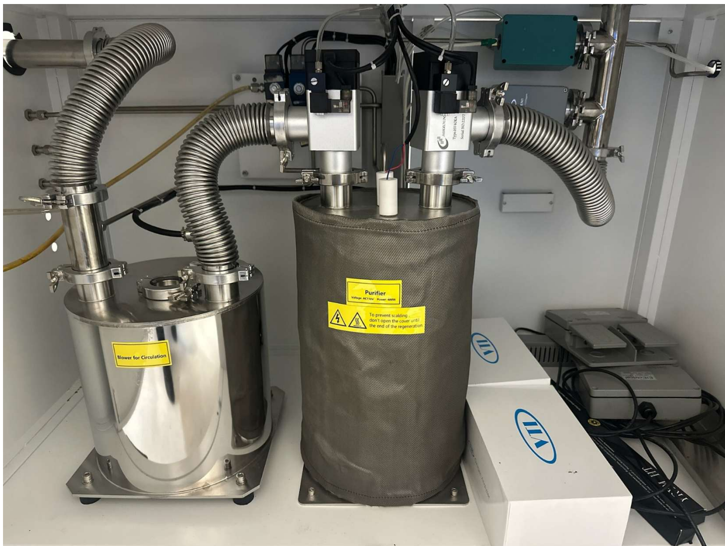
Purifier System with Catalyst Column (center), Blower Housing (left), in back ground is the solenoid manifold block and to the left is the Vacuum Technologies Inc O2 & H2O sensors.