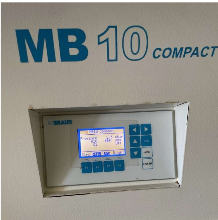
Purifier Control Panel