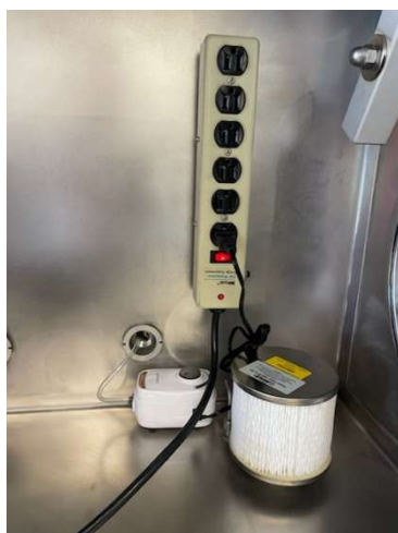
O2 sample pump

AMI Model 2001LC Trace Oxygen Analyzer uses an electrochemical sensor. It measures the concentration of oxygen in a gas stream, using an oxygen specific chemistry. It generates an output current in proportion to the amount of oxygen present, has zero output in the absence of oxygen. The cell is linear throughout its range. The span calibration may be performed using standard span gases or ambient air.