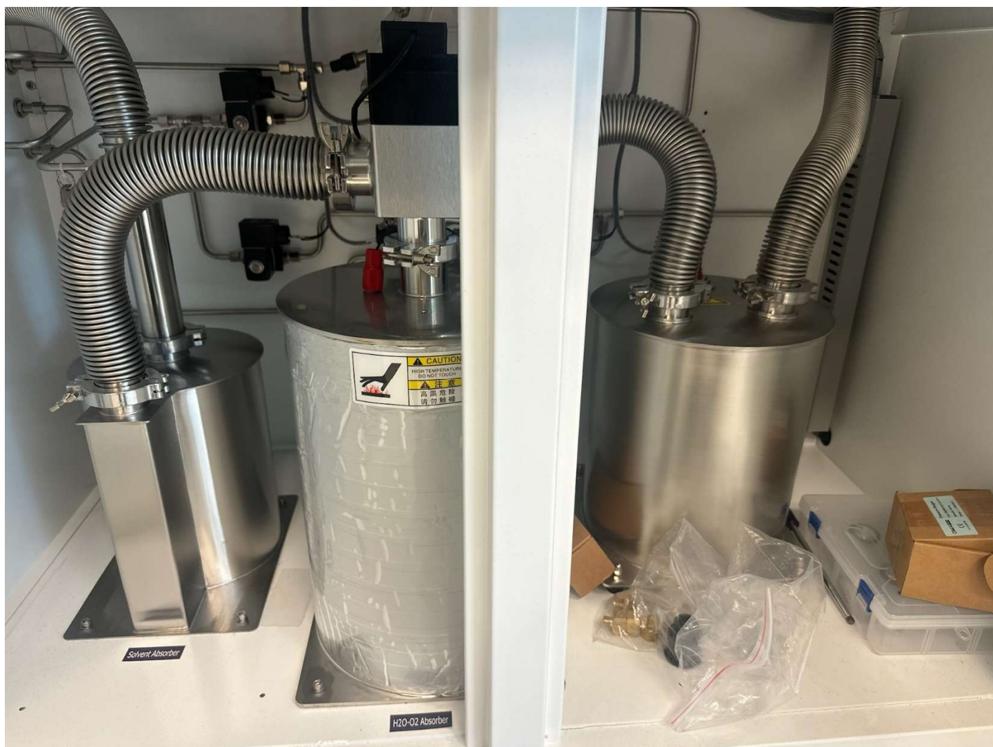
Purifier System with Solvent Trap (left) , Catalyst Column (center), Blower Housing (right)