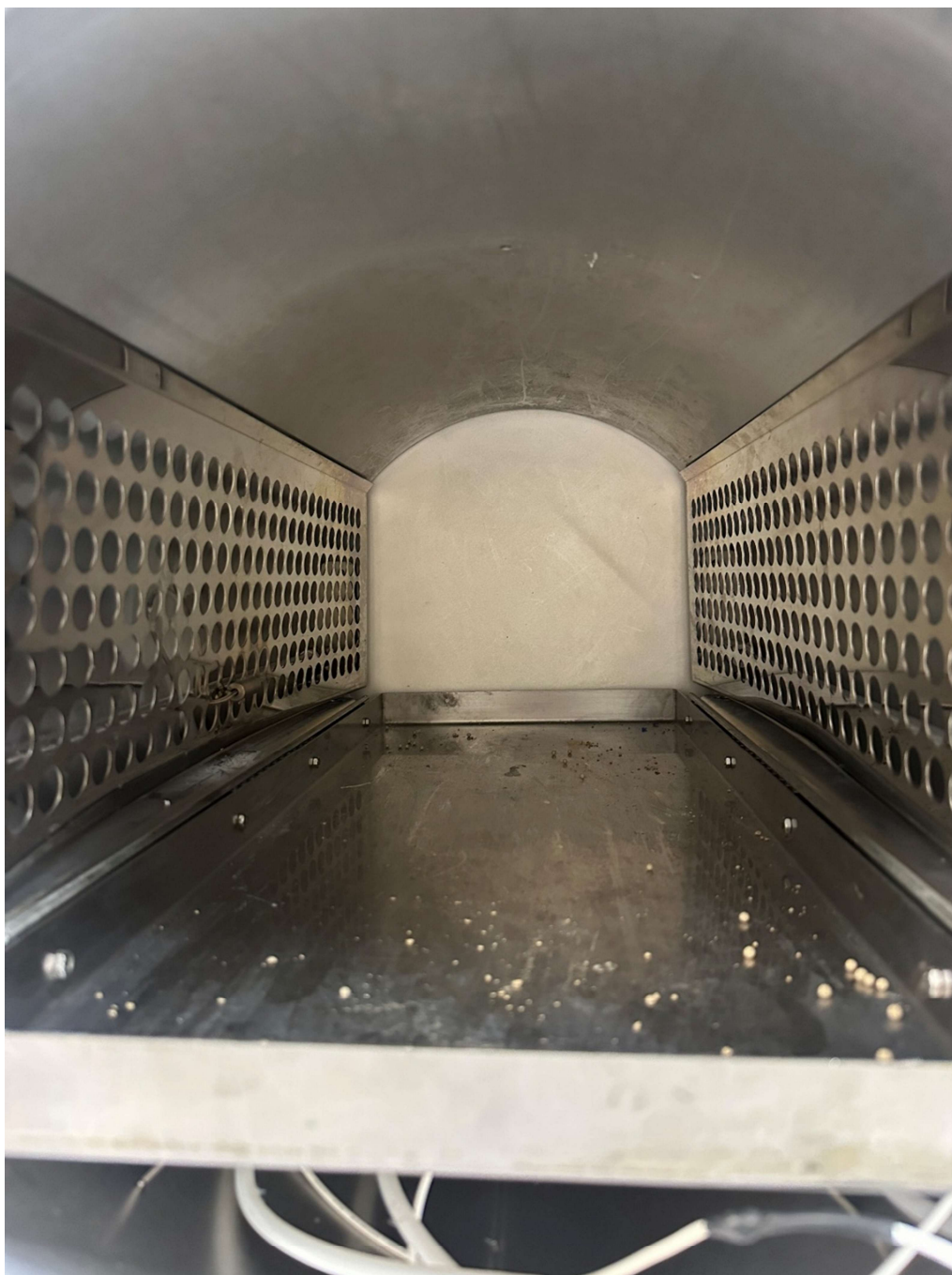
Interior of 150C Heated Antechamber

UsedGloveBox.com SCIENTIFIC MARKET SOLUTIONS