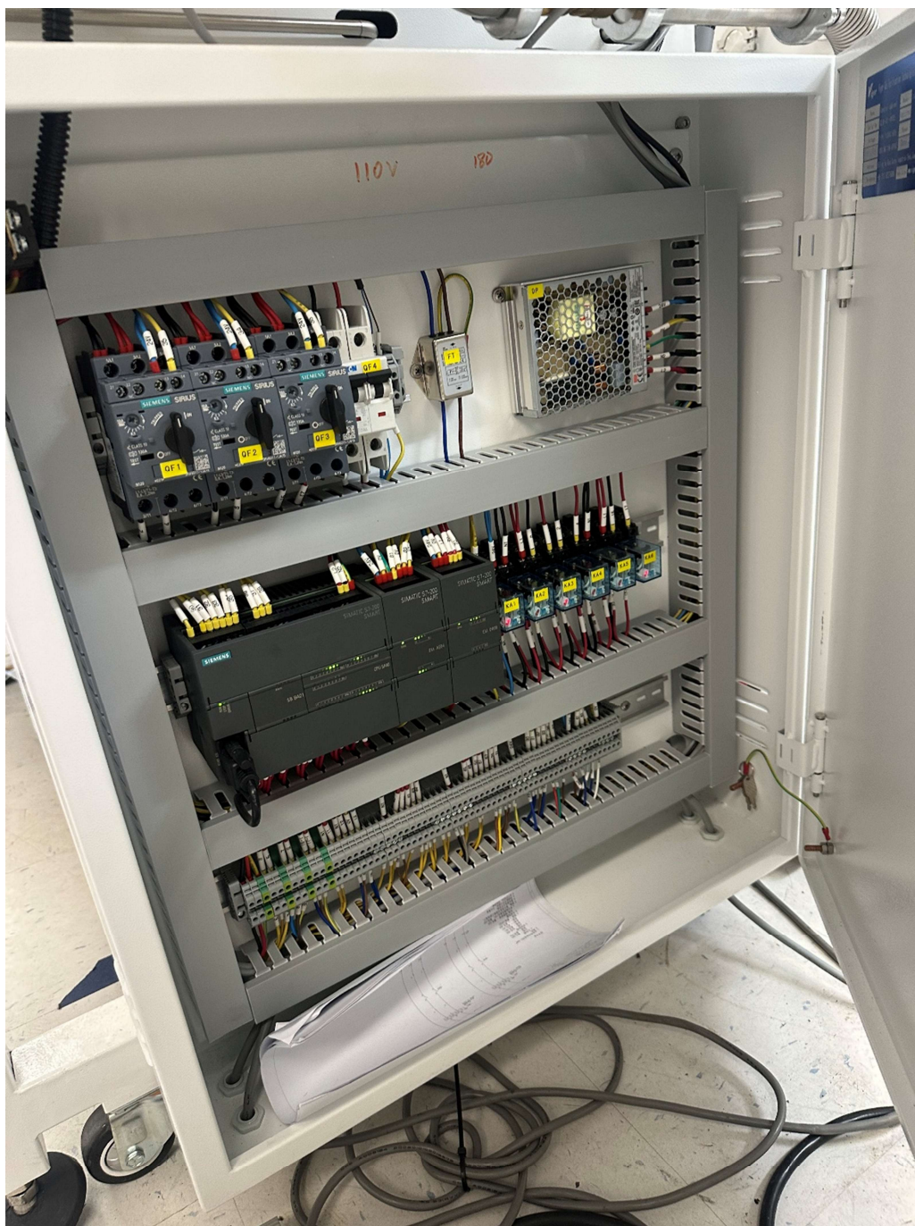
Electrical control cabinet

UsedGloveBox.com SCIENTIFIC MARKET SOLUTIONS