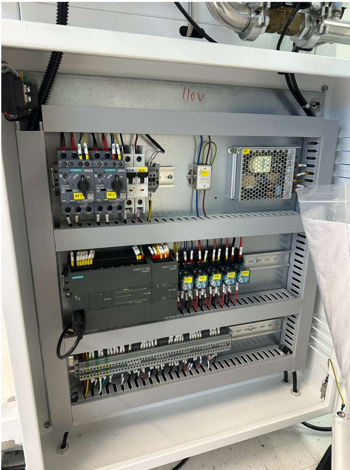
Electrical control cabinet