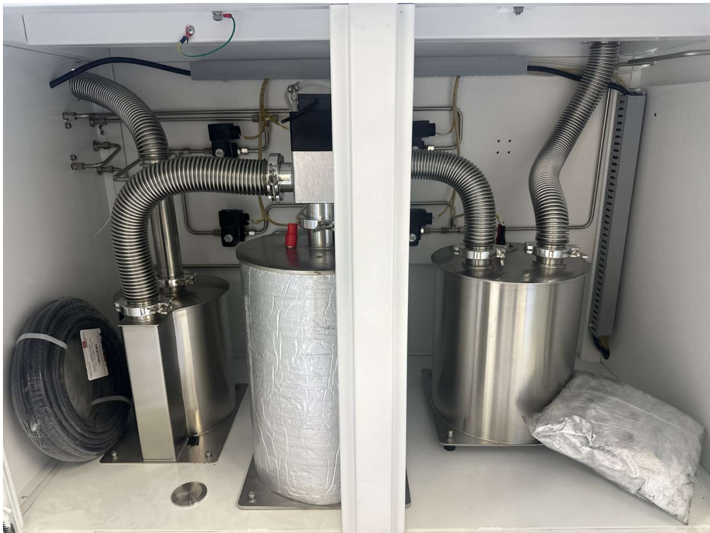
Purifier System with Solvent Trap (left) , Catalyst Column (center), Blower Housing (right)