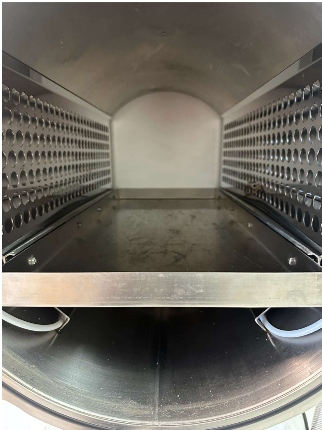
Interior of Heated Antechamber