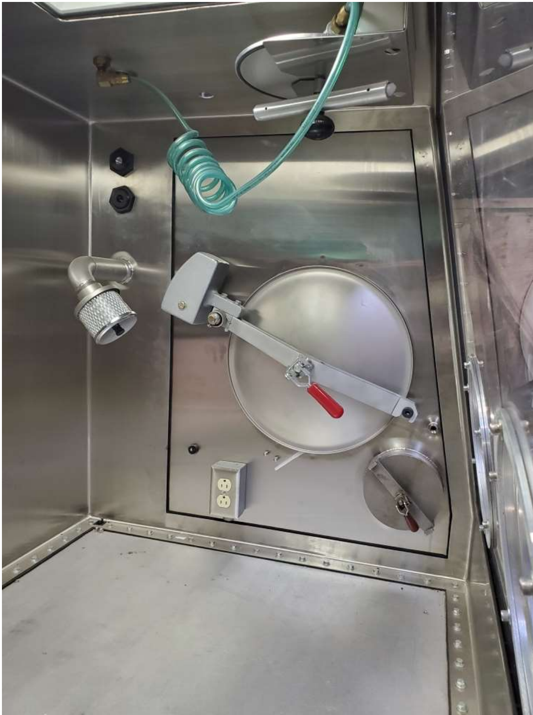
Internal view of large antechamber, internal evacuable gloveport cover is stored on ceiling