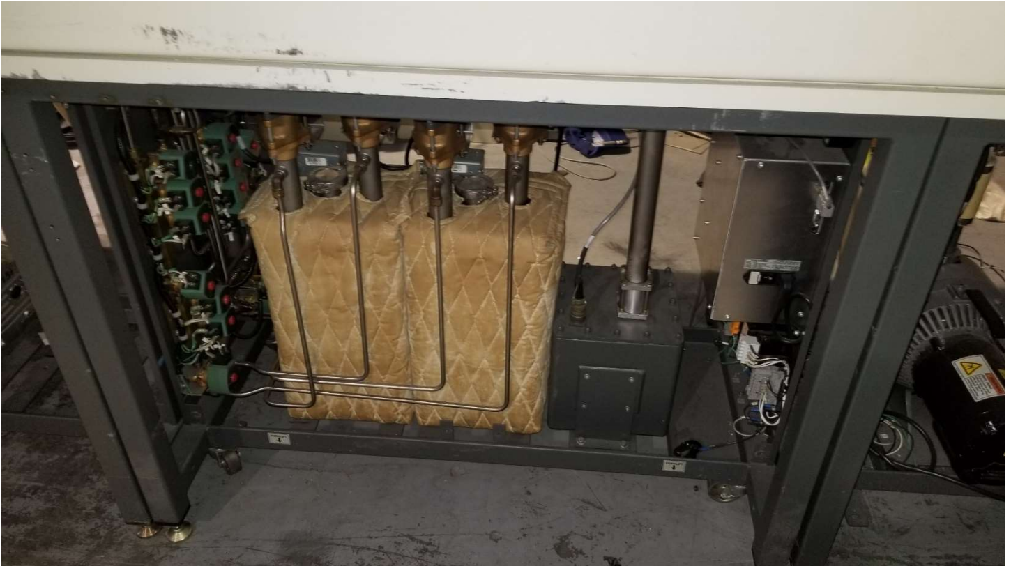
Dual purifier beds allow continuous circulation while regenerating the purifier bed not in use