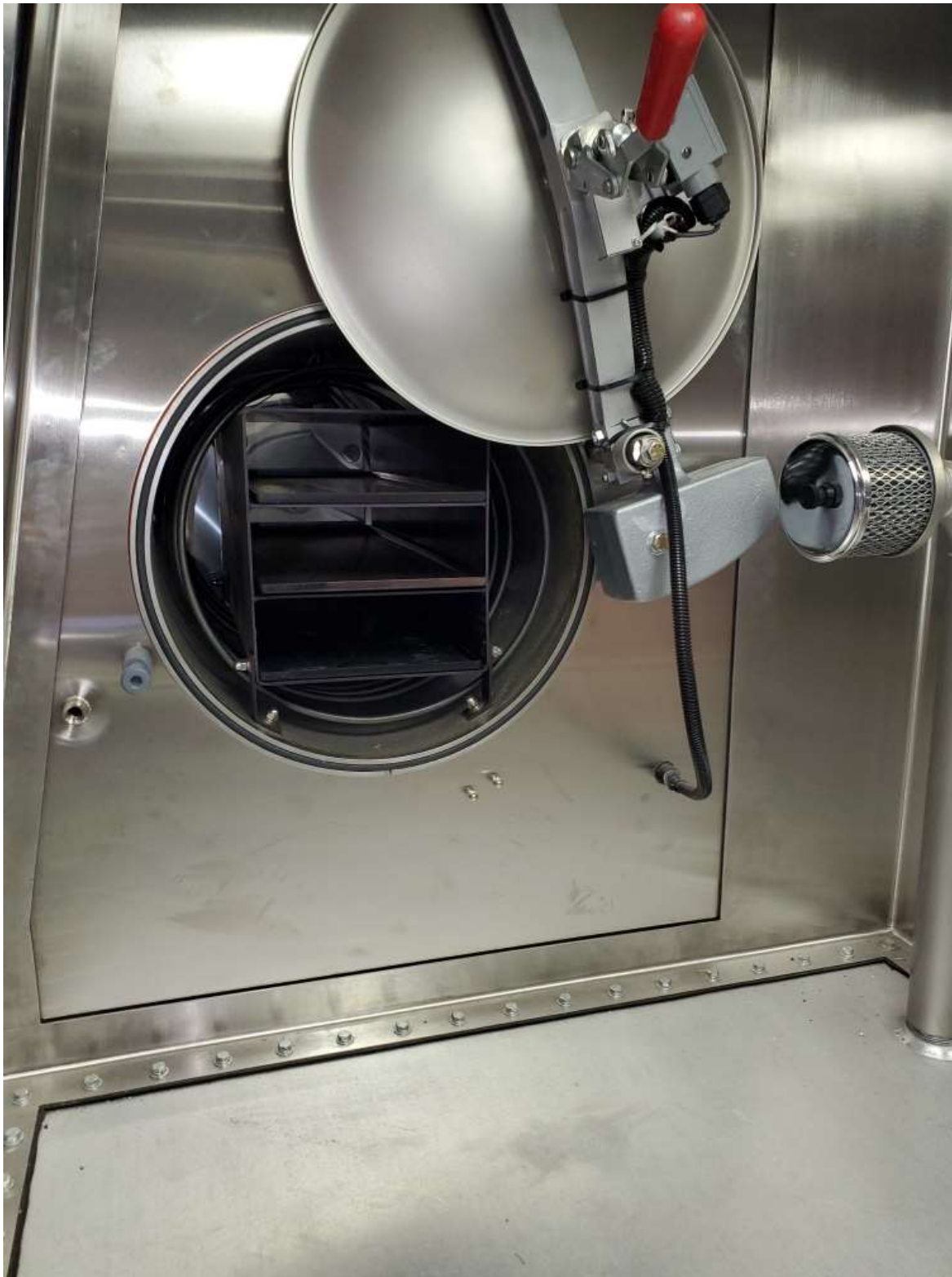
Internal view of vacuum oven