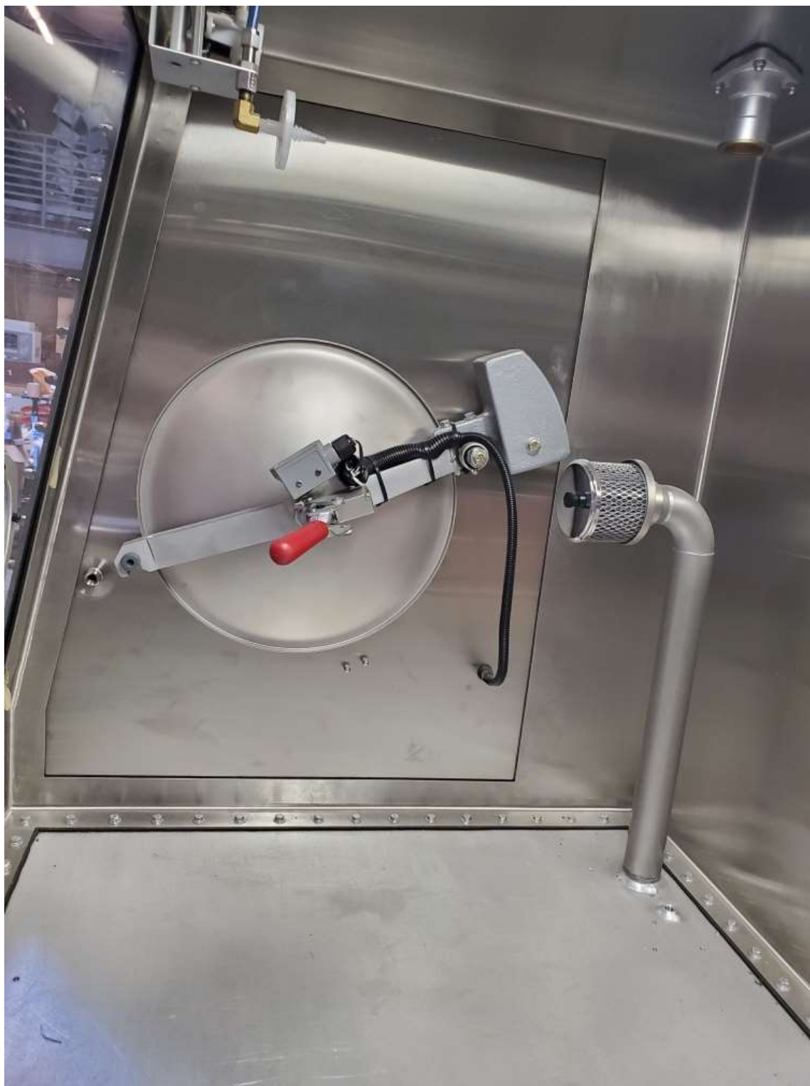
Internal view of vacuum oven, the O2 analyzer sample pump is on ceiling