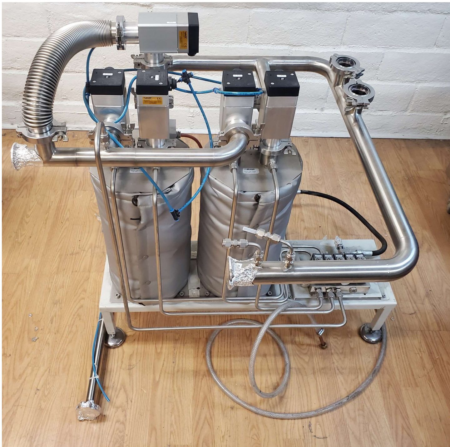
Optional in-line dual bed solvent absorber