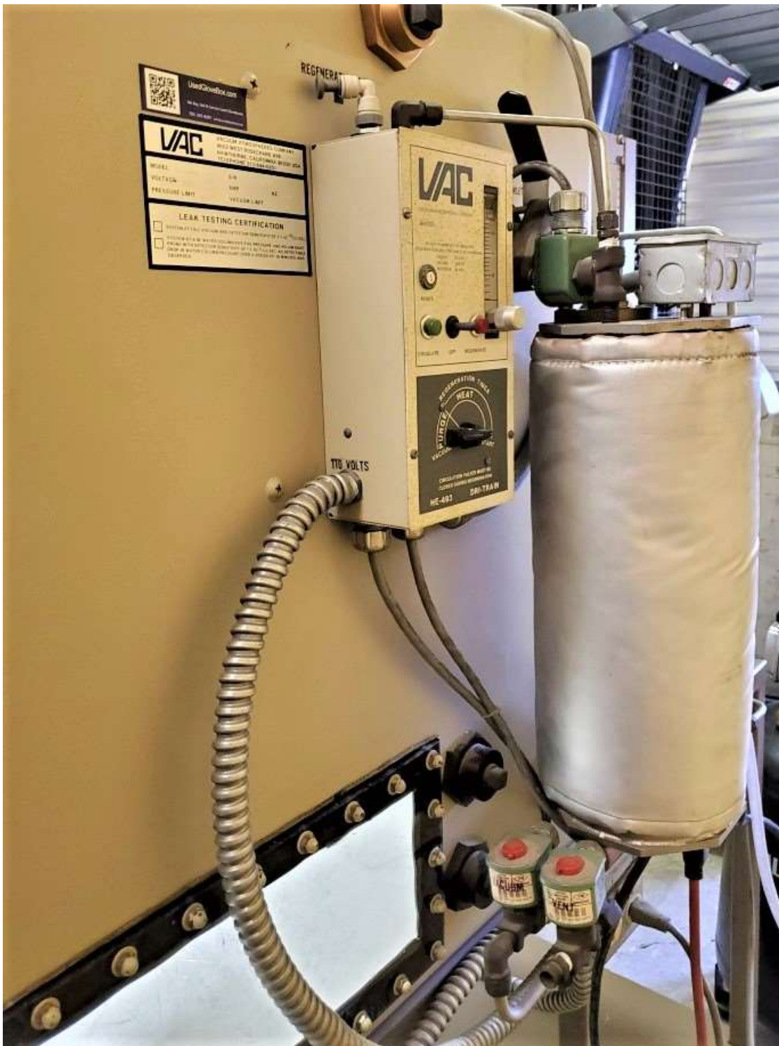
Rear mounted purifier, small window on back wall