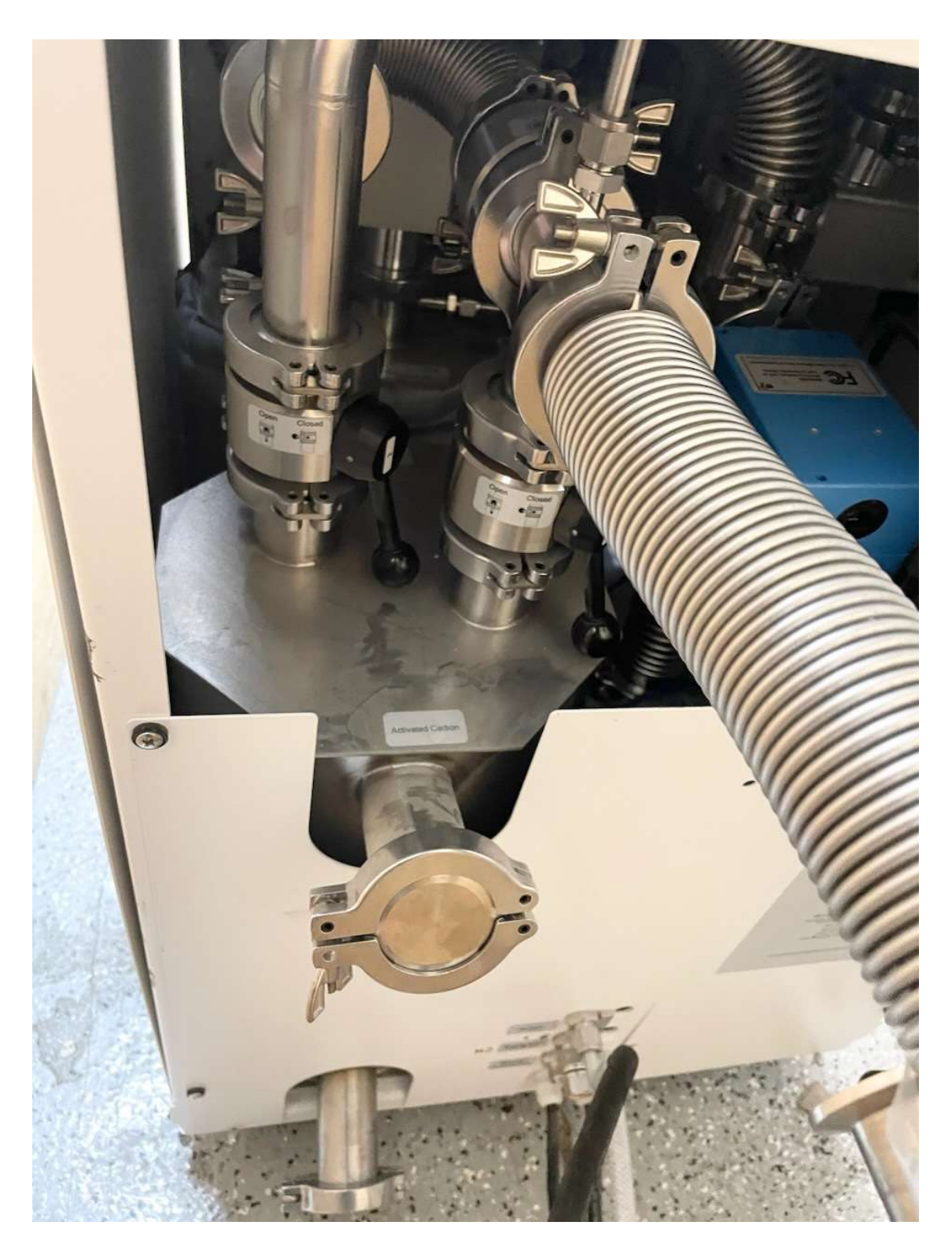
Rear view of the purifier with the solvent trap vessel and reactor vessel in the back