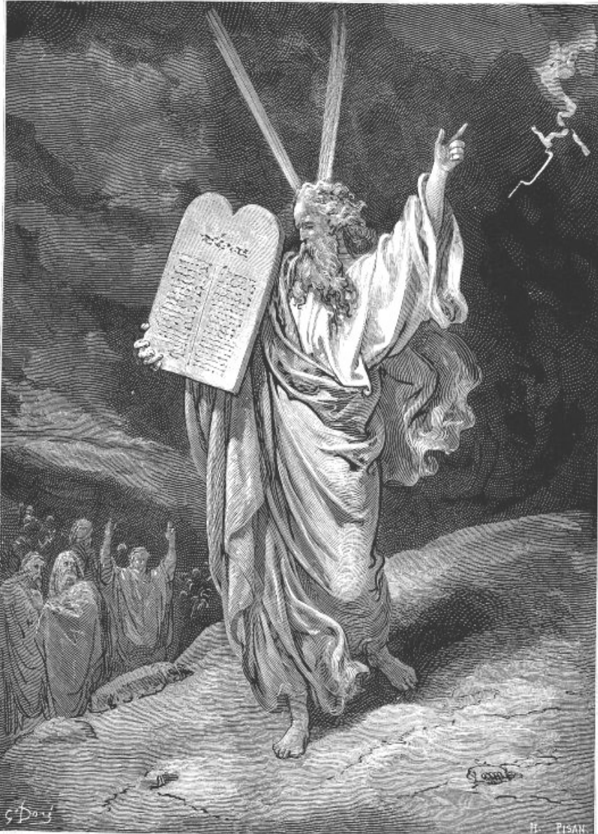
"Moses Coming Down From Mt. Sinai" by Gustave Doré

“Therefore go and make disciples of all nations, baptizing them in the name of the Father and of the Son and of the Holy Spirit.”