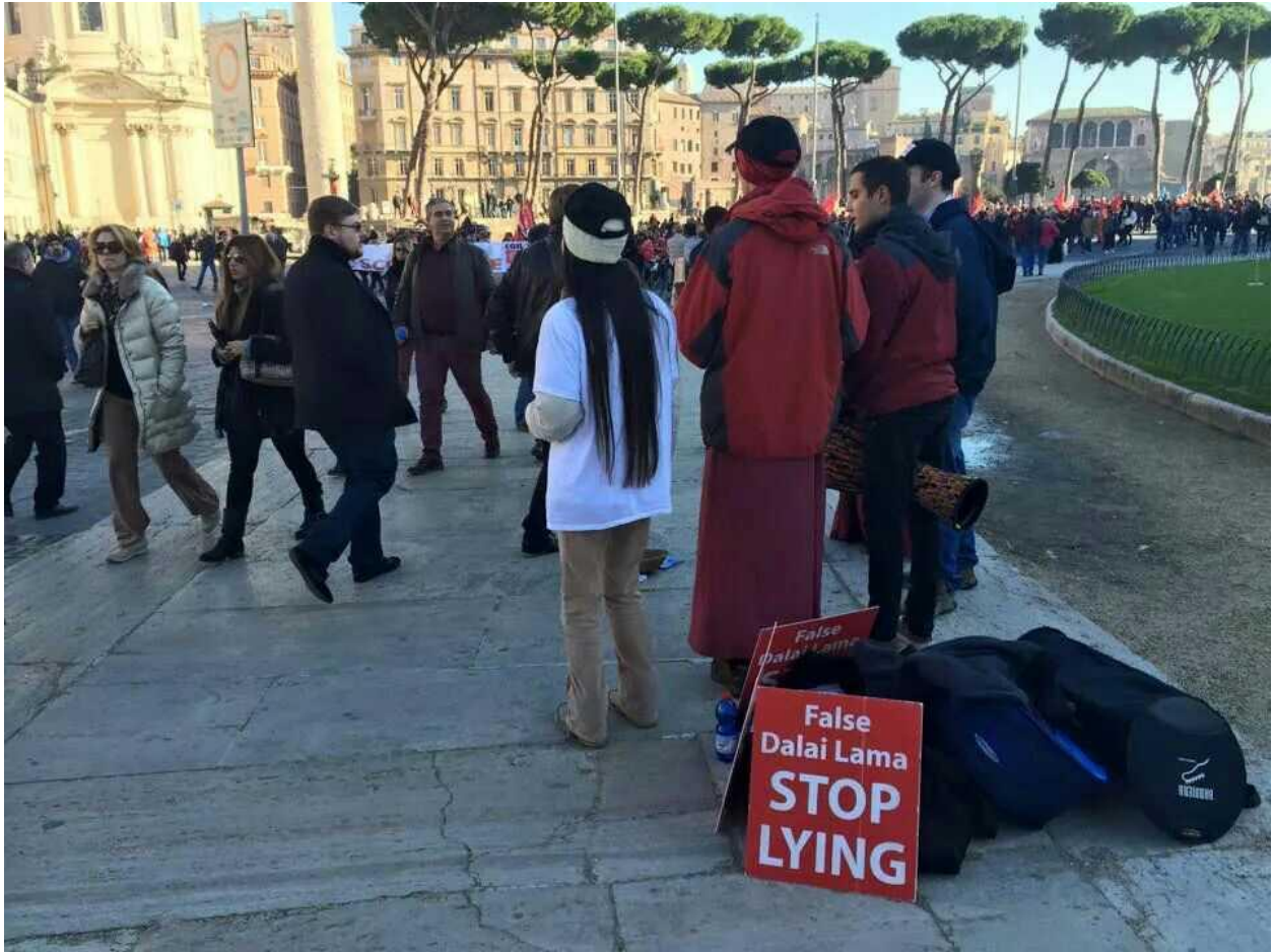
DEMONSTRATORS SINGING ABOUT DALAI LAMA LYING