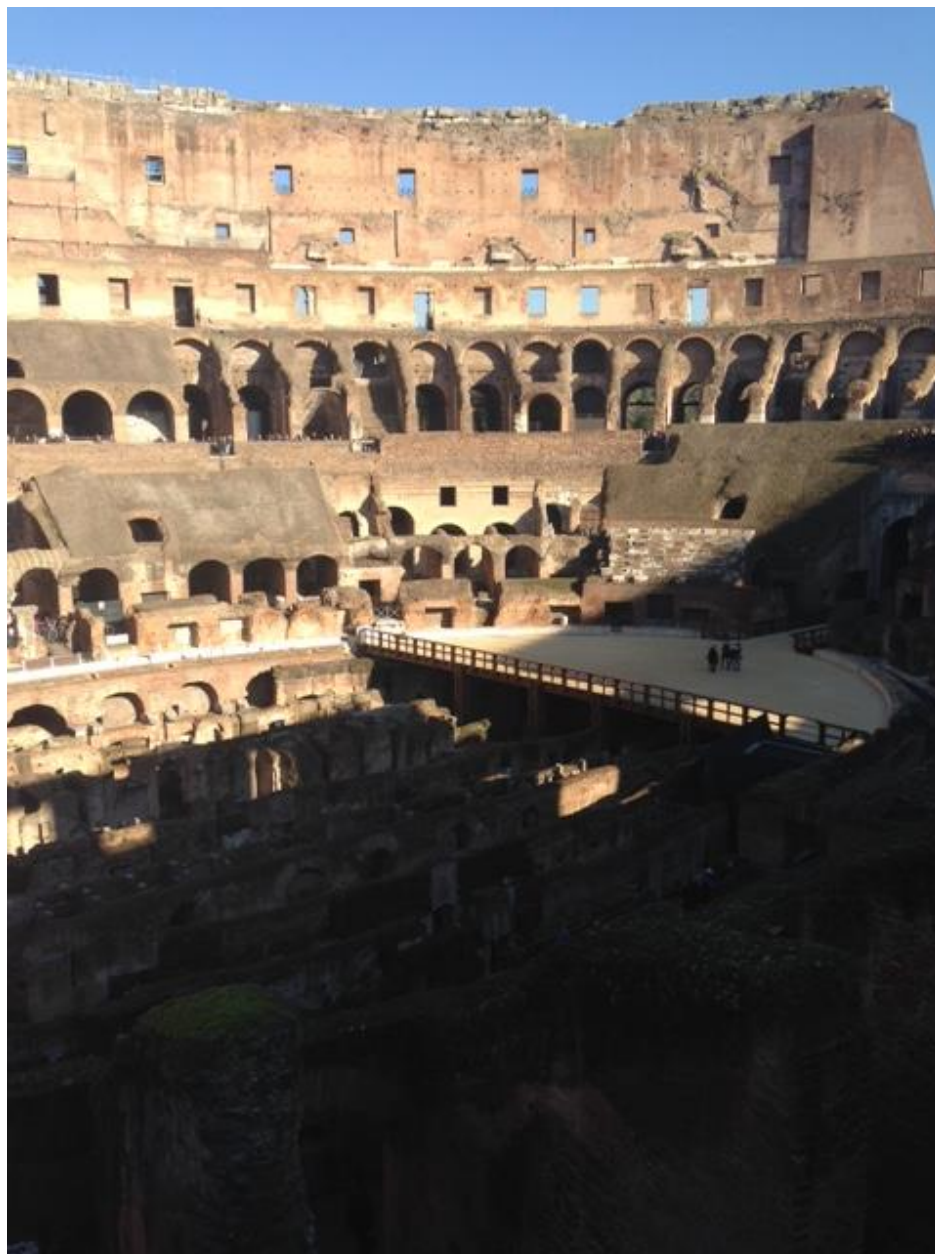
THE COLISEUM OF ROME