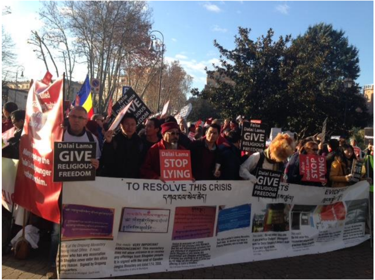
DEMONSTRATORS SHOWING EVIDENCE OF SEGREGATION