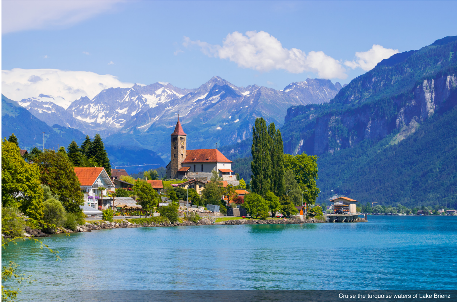
Cruise the turquoise waters of Lake Brienz