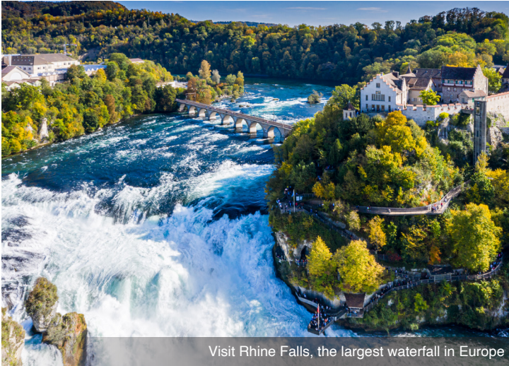
Visit Rhine Falls, the largest waterfall in Europe