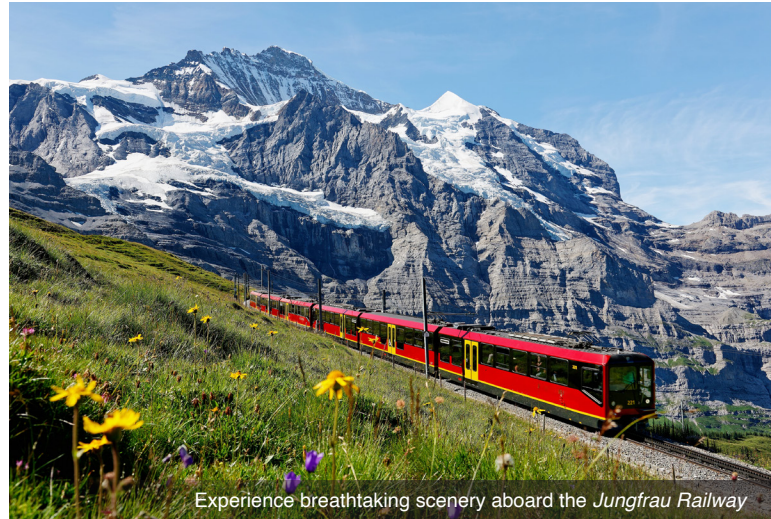
Experience breathtaking scenery aboard the Jungfrau Railway

DAY 1 Depart the USA: Depart the USA on your overnight flight to Zurich, Switzerland.