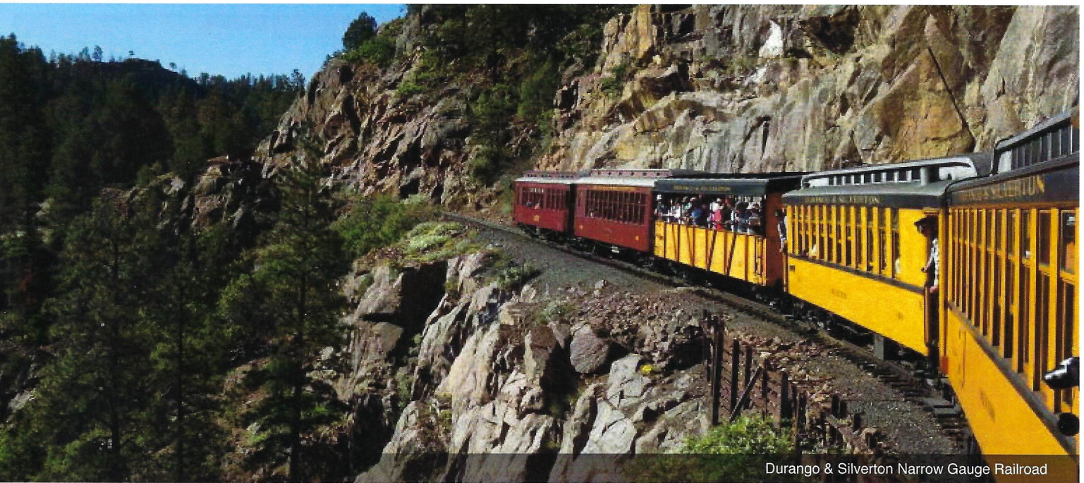
Durango & Silverton Narrow Gauge Railroad

DAY 6 Cumbres & Toltec Scenic Railroad: Your day begins as you board the motorcoach and ride to the Cumbres & Toltec Scenic Railroad, the original Rio Grande Line. This is America's most spectacular narrow gauge steam railroad. Explore 50 miles of wild and rugged territory between Chama, New Mexico and Antonito, Colorado, the highest point on the railroad. Meals: B, L