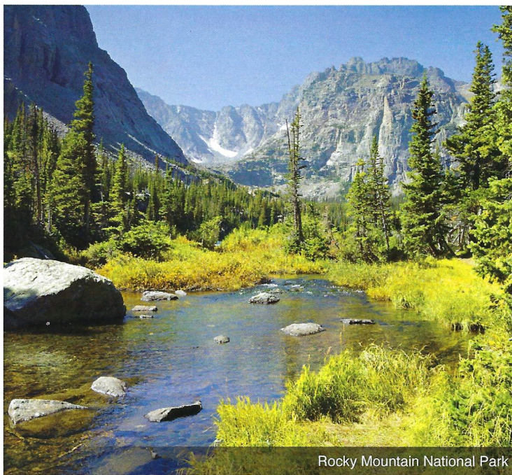
Rocky Mountain National Park