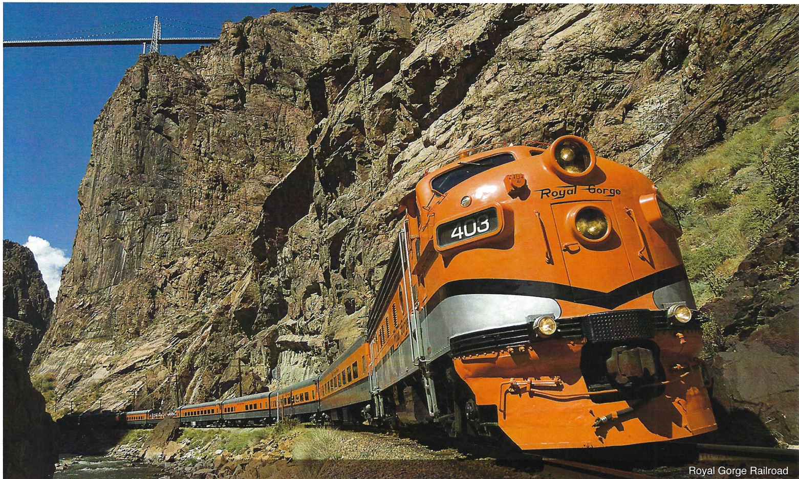
Royal Gorge Railroad