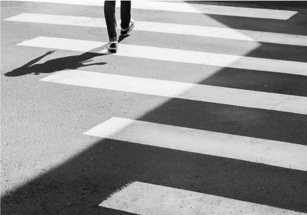
A step into Job marekt scenario

Success ratio : Converting the skill sets available with each individual into a successful job seeker.