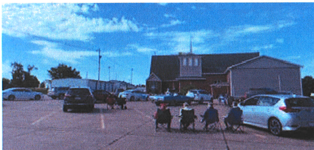
Families worshipping together

Thank you for being mindful of our social distancing recommendations. It is not easy. We follow the recommendations of the CDC and Synod for your safety and the safety of all others. Any questions, concerns, ideas, and praises can be given to our church council.