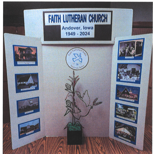
Chuck and Barb Corr shared this display at Synod Assembly showcasing our 75 year anniversary!