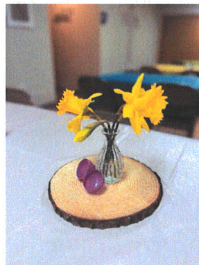
A daffodil centerpiece with an open Easter egg symbolizing the empty tomb at the Easter Breakfast.