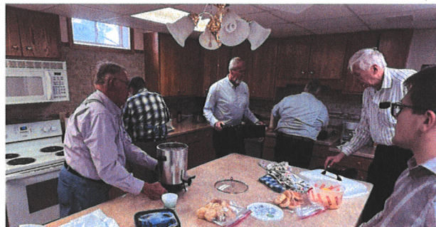
The men of the church making Easter breakfast.