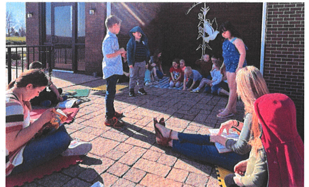
Our younger Sunday School kids took advantage of the nice weather and read their story outside.

(This recipe was shared by a friend from South Africa.)