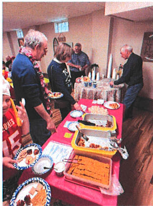
There were many dishes to sample at our Appetizer Cook-Off.