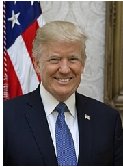
Donald J. Trump