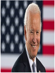
Joe R. Biden