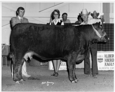
Figure 5 Grand Champion Alberta Aberdeen Angus Show