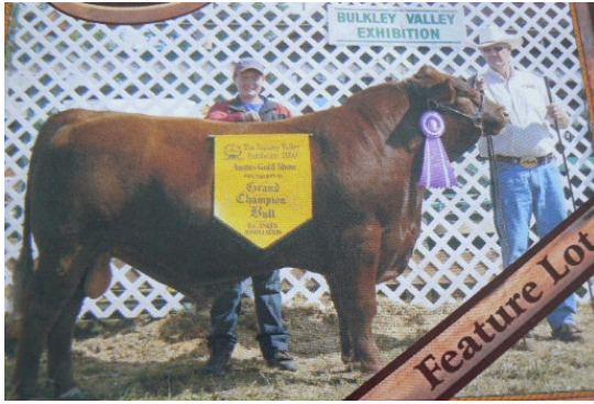
Figure 9 7W