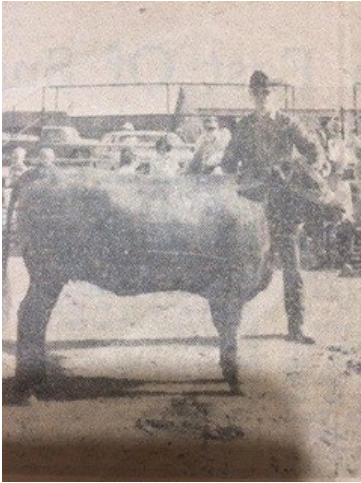
Figure 2 I Won the Grand Champion Female Honors

Finally, we pulled through, putting the Red Angus cattle in the limelight. We were so excited when the judges started to recognize us! The following newspaper clippings, verify this big event: