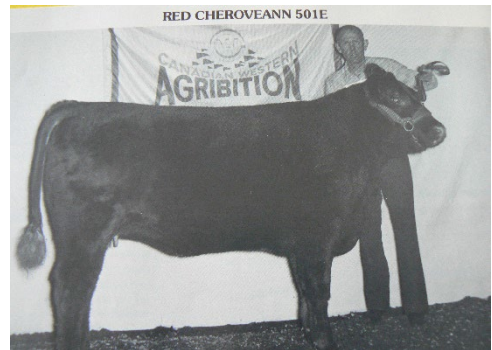
Figure 4 Grand Champion Canadian Western Agribition Show