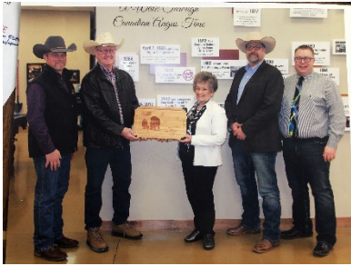
Figure 21 50-Year Award

2017 —50 years of Membership in Canadian Angus Association Award