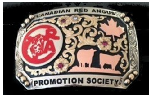
Figure 22 Lasting Legacy Award