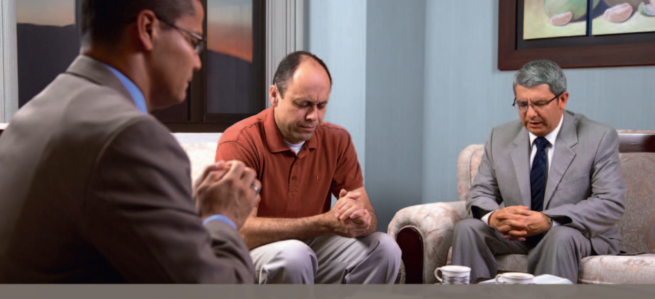
Jehovah wants you to experience the relief of a clean conscience

(2 Samuel 12:13) Today, Jehovah has provided congregation elders who have been trained to help repentant sinners restore their friendship with Jehovah. When you approach the elders, they will use the Scriptures and offer heartfelt prayers to soothe your heart, lessen or remove your negative feelings, and help you to heal spiritually.—James 5:14-16.