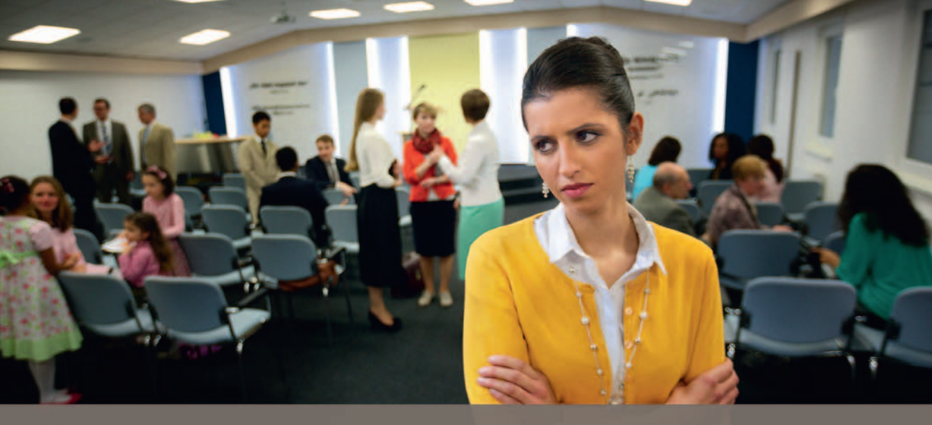
When we let go of resentment, we benefit ourselves

let go of resentment. Really, letting go is for our own good.—Proverbs 11:17.