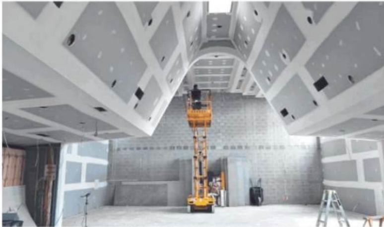
SNEAK PEEK: The ceiling of the reconstructed Toowoomba Mosque has now been covered in gyproc as renovations continue at the facility.