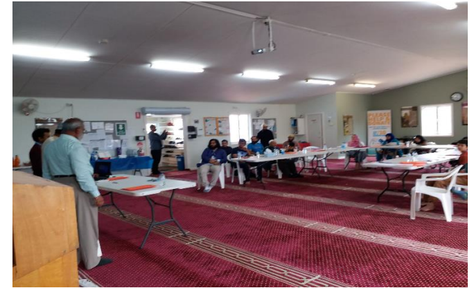
DV Workshop and interactive session at Toowoomba Mosque

As a part of the Domestic and Family Violence Prevention grant, funded by the Queensland Government, the Toowoomba Islamic Charitable Trust arranged a workshop and essay competition on Domestic Violence (DV). The DV workshop was held on 12 December 2020. The theme of the workshop was Together Against Family Violence .