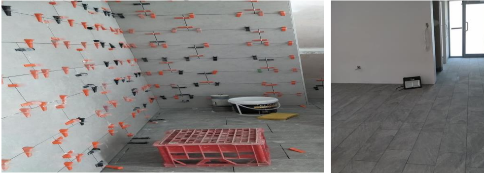
Tiling work in progress

After completion of internal painting last month, tiling work has started last week. The waterproofing in the wet areas has been completed.