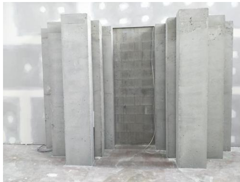
Inside the reconstructed Mosque building and Mehrab area