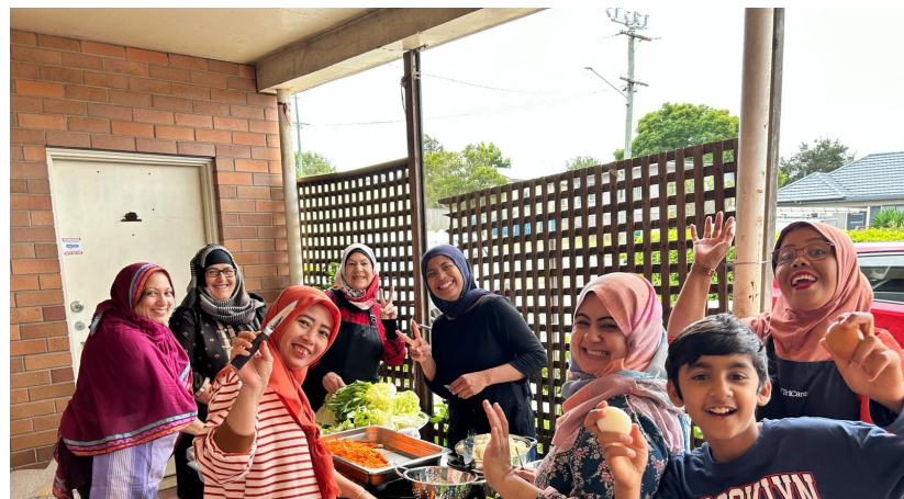
Iftar preparation by our sisters