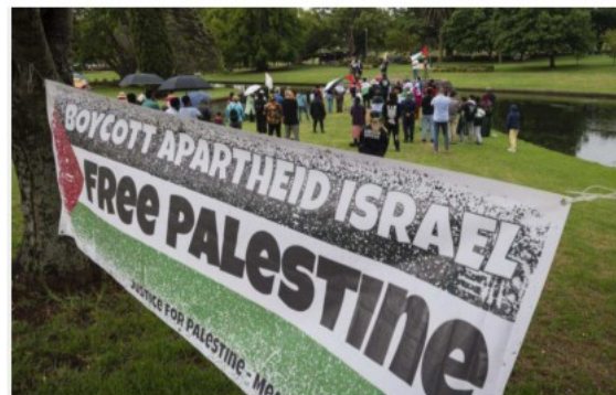
Toowoomba Vigil for Peace in Palestine at East Creek Park, Saturday, November 25, 2023.

The vigil served as a platform for the community to unite and support the people of Gaza during this challenging time. The Islamic Society of Toowoomba continues to advocate for peace, humanitarianism, and the well-being of all, locally and globally, in the spirit of unity and understand-