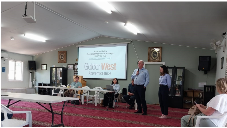
Job and Career Information Session run by Department of Employment, Small Business and Training and Golden West