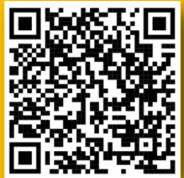
SCAN TO WATCH THE VIDEO

Their efforts bore fruit as the bottles were diligently collected and sent for refunds, resulting in the mosque earning approximately A$750 so far. Beyond the monetary gain, this exercise served as a valuable lesson for our children, instilling in them a sense of responsibility and respect for both the environment and their community.