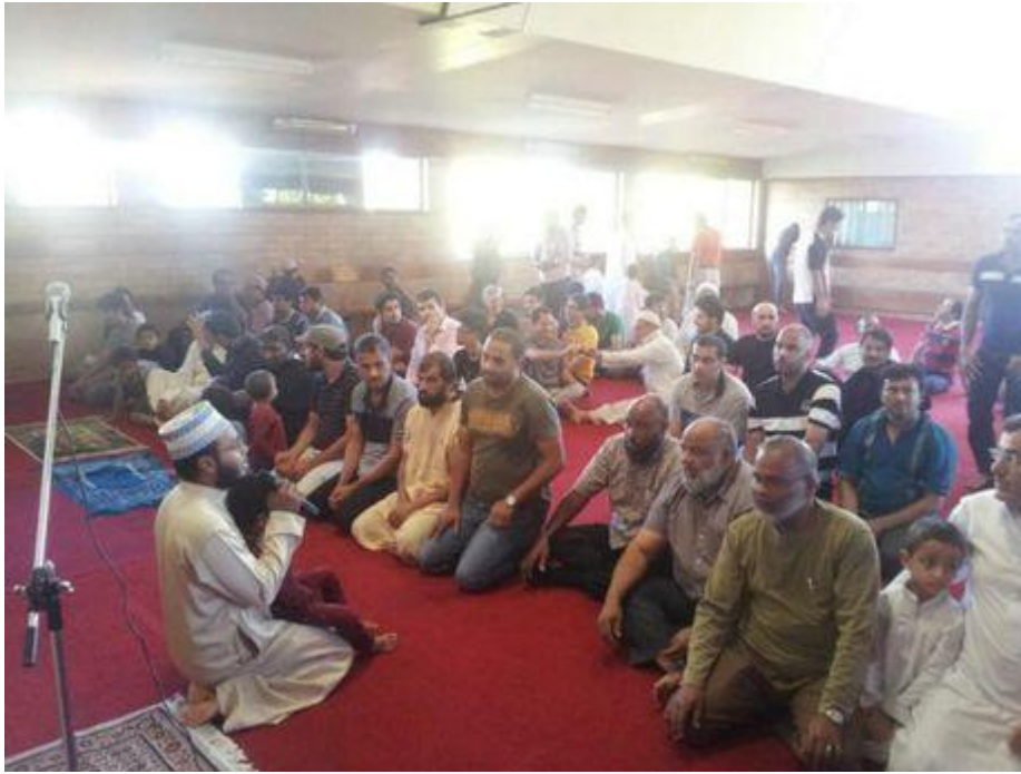
Toowoomba's Muslim community meets for the first prayers held at the city's first mosque in South Toowoomba.

The former church was chosen for its central location and the fact the building faces Kaaba - a square stone building in the centre of the Great Mosque at Mecca.