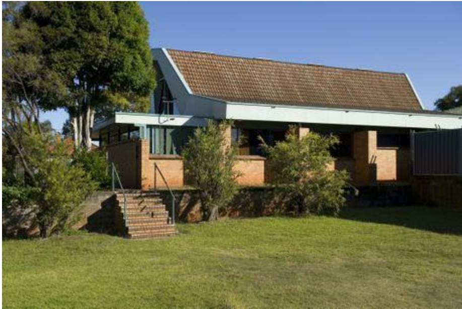
The former Westside Christian Church on the corner of West and Stephen Sts has been bought by the Islamic Society of Toowoomba.

Experience suggests that the presence of a mosque in Toowoomba will attract more professionals to the city and enrich its ethnic and cultural diversity.