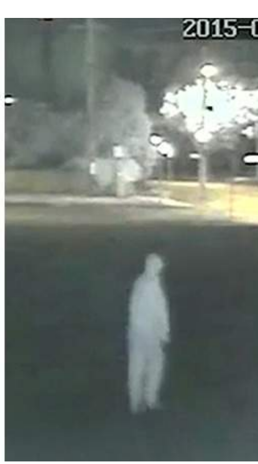
CCTV released by Queensland Police shows the suspected arsonist.

At the time, there were predictions "10,000 rednecks" would oppose the mosque, set on a large corner block in a leafy residential suburb near the CBD. But it didn't happen. Apart from some neighbours' complaints over parking problems, and a few obscenities shouted from passing vehicles, peace and harmony prevailed in the Darling Downs city once described as "the buckle on Queensland's Bible belt".