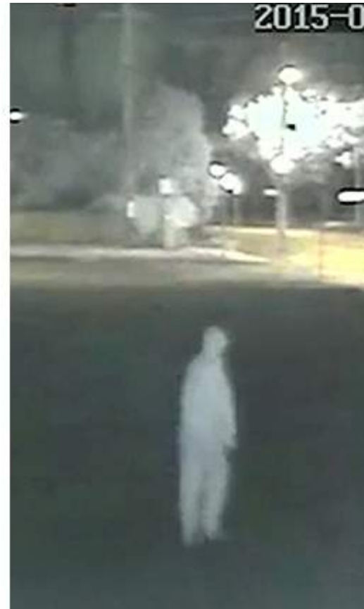
CCTV released by Queensland Police shows the suspected arsonist.

At the time, there were predictions “10,000 rednecks” would oppose the mosque, set on a large corner block in a leafy residential suburb near the CBD. But it didn’t happen. Apart from some neighbours' complaints over parking problems, and a few obscenities shouted from passing vehicles, peace and harmony prevailed in the Darling Downs city once described as “the buckle on Queensland’s Bible belt”.