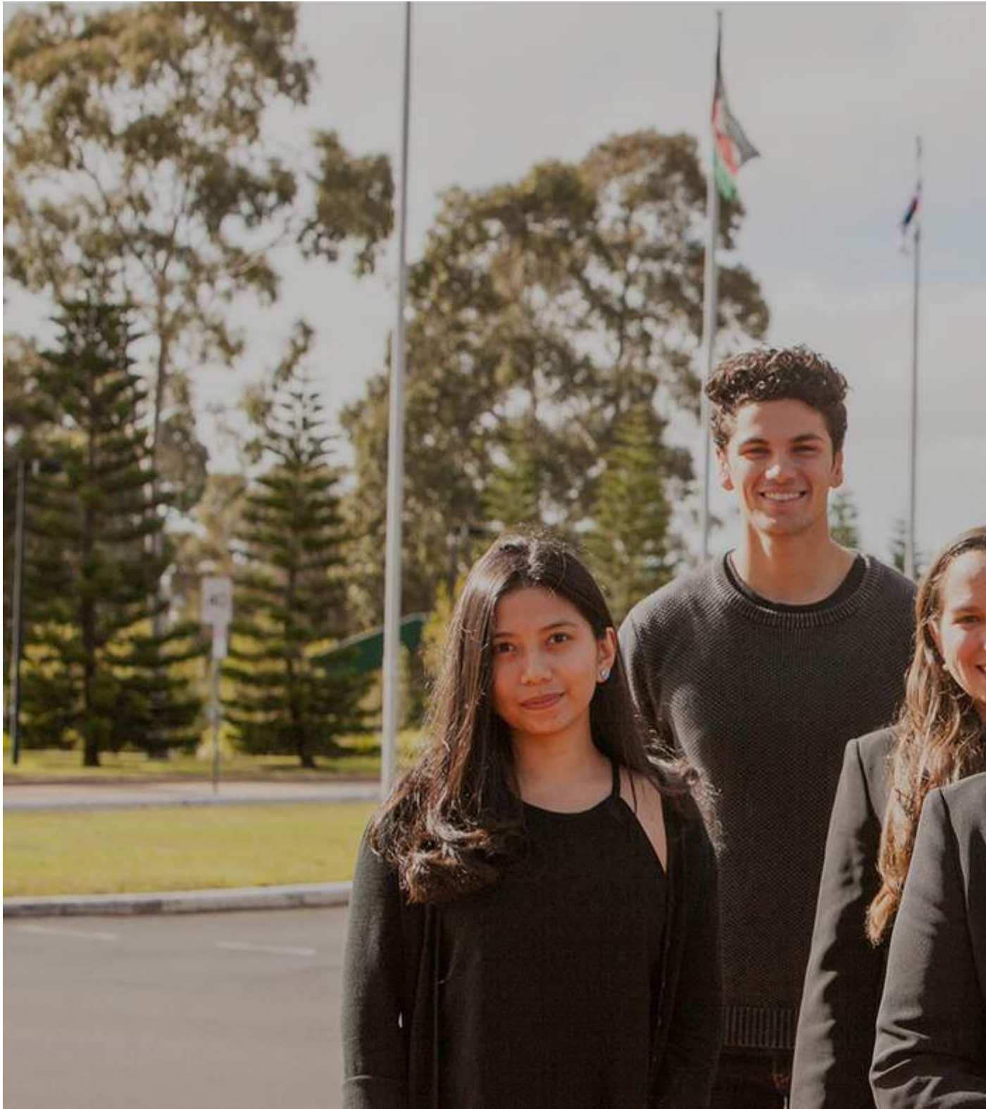
The entranceway to the sprawling USQ campus is lined by the flags of many nations, reflecting the diversity of its international students (drawn