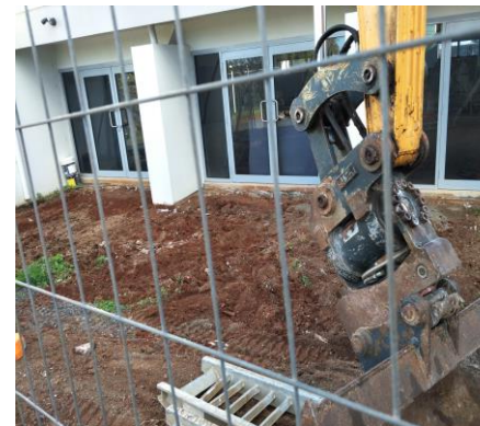
Removing old concrete for plumbing work