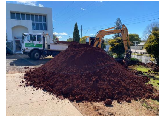
Earth moving for underground rainwater tank

The plumber has started working on stormwater management and setting of 22,500 litre underground rainwater tank for the Mosque. The water preserved in the rainwater tank will help reduce the use of town water as part of the Mosque’s strategy to be environmentally friendly facility. The current work will include removal of old concrete from the front area of the reconstructed Mosque building to facilitate the running of new pipes and plumbing work.