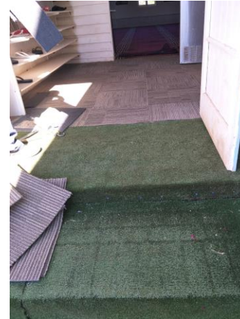
The new look entrance of the current prayer hall

Br Muhidin Hadzich has completed another renovation of the current prayer hall entrance. This is his latest contribution to the Mosque and community. The entrance is looking more impressive, clean and tidy. Worshippers no more stepping inside the Mosque with shoes on. A bid thankyou to Br Muhidin and all users of Mosque, especially the children for keeping it clean. This will certainly keep the payer hall clean and hygienic.