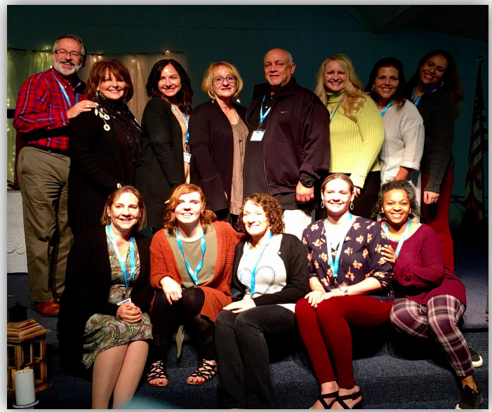
2020 Fall Retreat Ministry Team