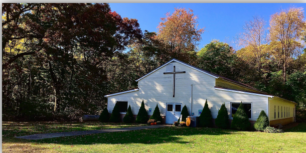
Retreat Facility Greenville, PA

The 2020 Fall Retreat was a beautiful success. God showed up and moved powerfully amongst His beloved daughters. Six retreat participants came from various parts of the the Pittsburgh and Erie areas, and one as far as Portland, Oregon. These precious women came to receive healing from the wounds of past abortions. They came from different age groups and backgrounds, but all came clothed with the grave clothes of guilt and shame. As the Lord laid forth His perfect plan for these surrendered women, hour by hour, we watched their healing unfold before our eyes and the grave clothes turned into robes of righteousness. It was truly miraculous to see the Lord transform these beautiful lives in such a short period of time. They walked away with peace and a renewed hope for their future.