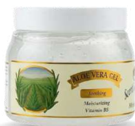
Aloe Vera Gel Aloe Vera (Zephyrium) Soothing & Moisturizing - Vitamin B5 500 ml | 16,90 fl. oz. Master Pack: 12 pcs

It instantly refreshes the skin, helps soothe sensitivity and maintain moisture balance; its light texture is quickly absorbed and does not leave a sticky feeling