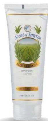
Aloe Vera Gel Aloe Vera (Zephyrium) Soothing & Moisturizing - Vitamin B5 300 ml | 10,14 fl. oz. Master Pack: 12 pcs