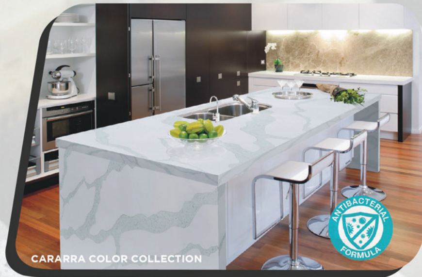
CARARRA COLOR COLLECTION

With over 20 years of experience, Bitto Quartz is a leading manufacturer specializing in high-quality quartz, synthetic stones, and versatile solid surfaces. Committed to excellence, Bitto ensures superior quality, durability, and innovative designs that enhance any space.