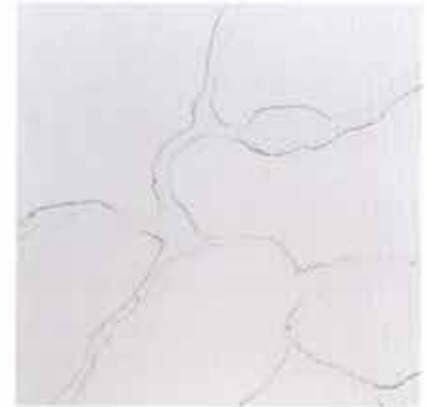
BQ801 Calacatta Snow