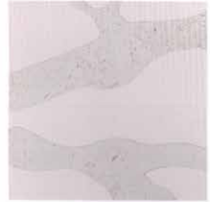
BQ806 Calacatta Spring